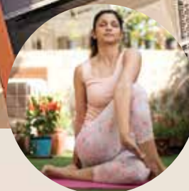
Yoga Meditation Zone