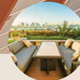
Lounge Seating Area