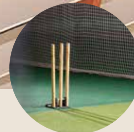
Mini Sports Turf