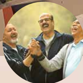
Senior Citizen's Corner