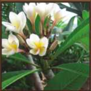
Frangipani tree with decorative pot