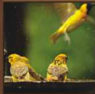
Bird bath and seating in terrace