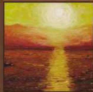
Acrylic painting on canvas