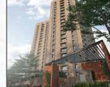
ECO GRANDEUR, SURAT