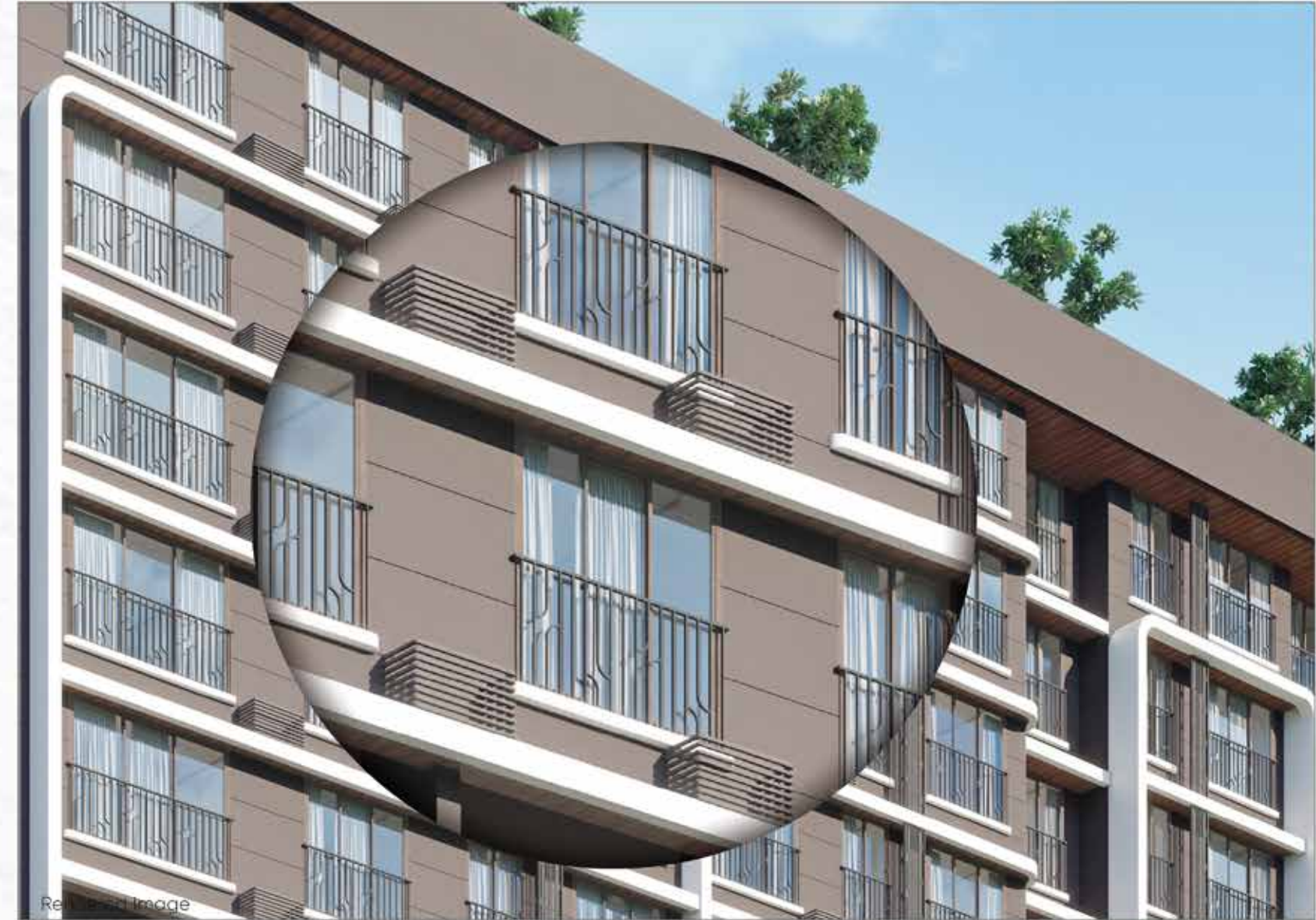
AC Unit Provision