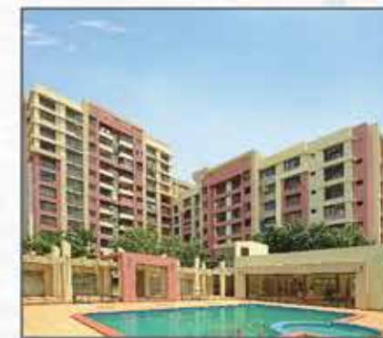
ECO PARK, ANDHERI (E)