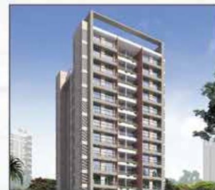
ECO RESIDENCY, ANDHERI (E)