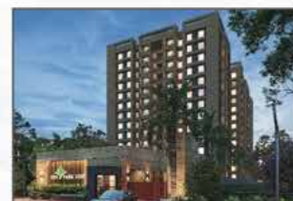
ECO PARK SIDE, SURAT