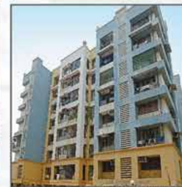
ECO HEIGHTS, ANDHERI (E)