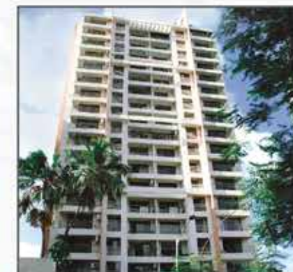
ECO TOWER, GOREGAON (W)