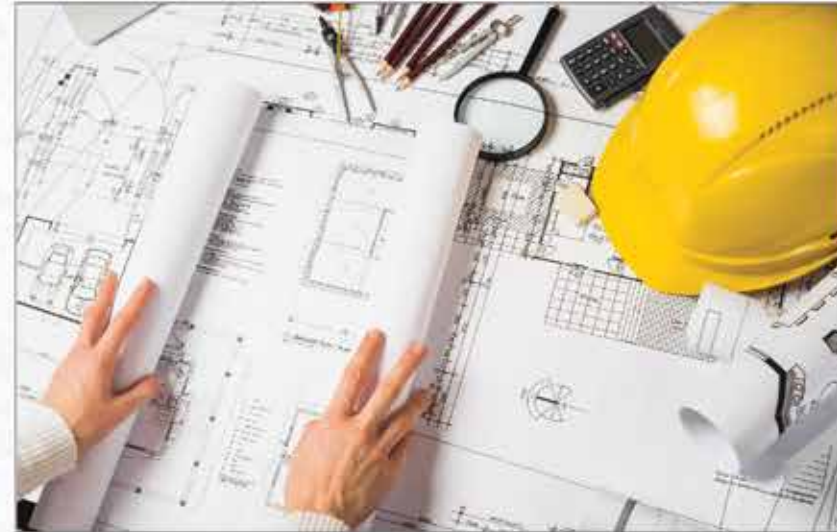
Zero Space Waste