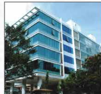
ECO HOUSE, GOREGAON (E)