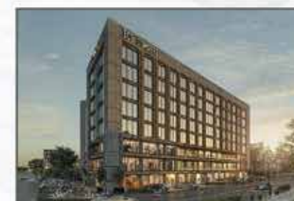
ECO COMMERZ, SURAT