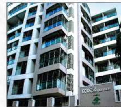
ECO ELEGANCE, ANDHERI (E)