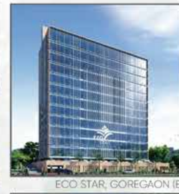
ECO STAR, GOREGAON (E)