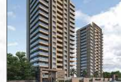
ECO GARDENS, SURAT