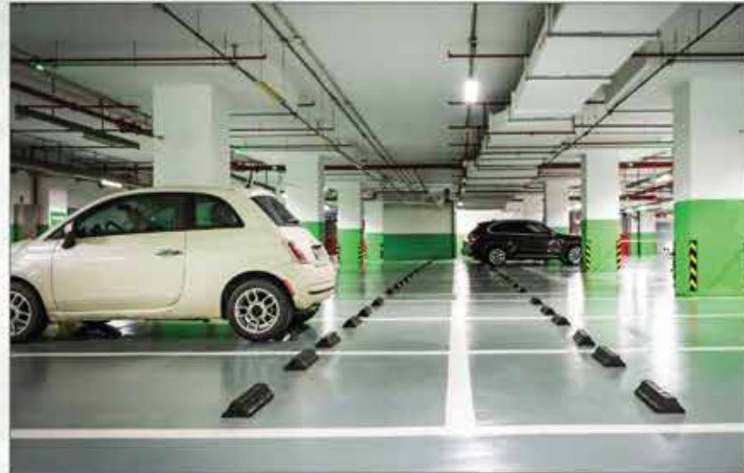
Independent Parking 2