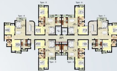
1 st , 2 nd , 3 rd , 4 th , 5 th , 6 th , 7 th , 8 th , 9 th & 10 th Floor Plan For Tower - A, B, C, P & Q 1 st , 2 nd , 3 rd , 4 th , 5 th , 6 th , 7 th , 8 th , 9 th , 10 th & 11 th Floor Plan For Tower - F, G, I & M