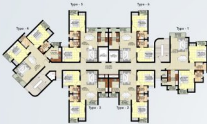
1 st , 2 nd , 3 rd , 4 th , 5 th , 6 th , 7 th , 8 th , 9 th , 10 th & 11 th Floor Plan For Tower - N & O