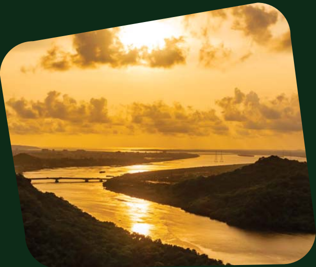
Gaimukh Creek Promenade - 15 mins