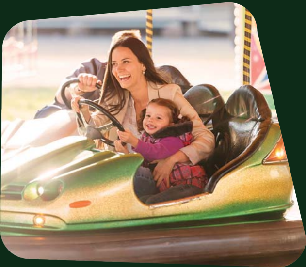
Tikuji-ni-Wadi - 7 mins