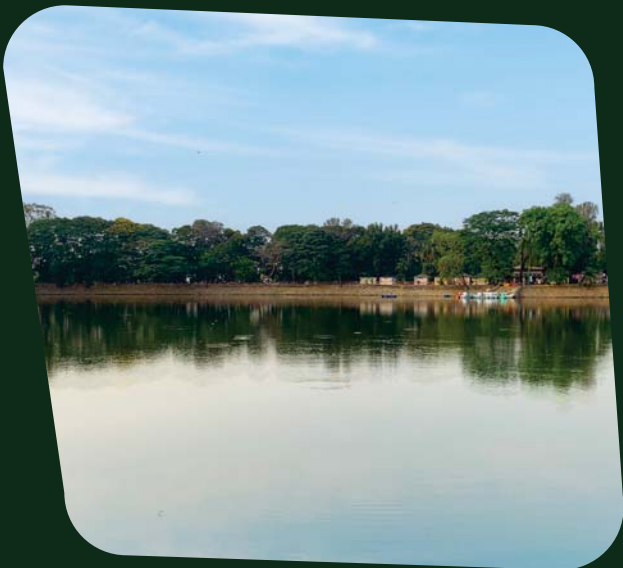
Upvan Lake - 20 mins Kasarvadavali Lake - 5 mins Heart Lake - 20 mins