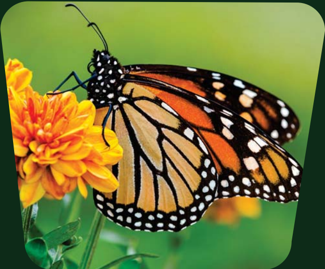
Butterfly Garden - 15 mins Hill Garden - 15 mins Swastik Garden - 20 mins