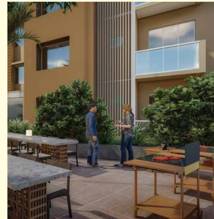
All Images are Artistic Impressions