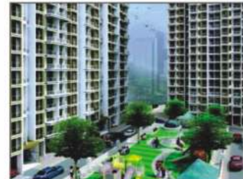
Nakshatra Greens, Naigaon (E) Maha Rera Reg. No.: P99000008753 / P99000005051