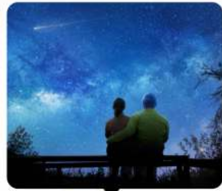
Star Gazing Point