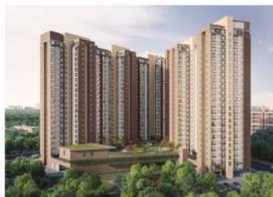
Nakshatra Aazstha, Vasai (E) Maha Rera Reg. No.: P99000051584