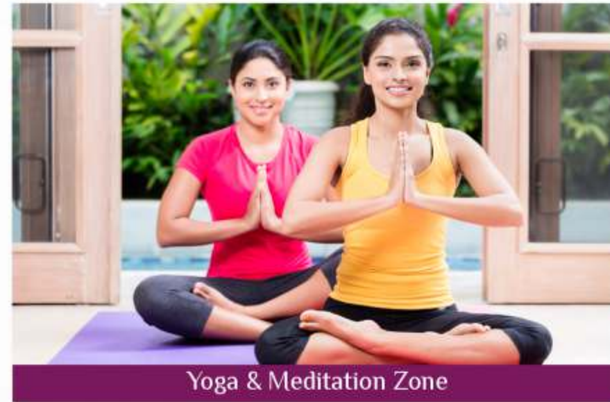
Yoga & Meditation Zone