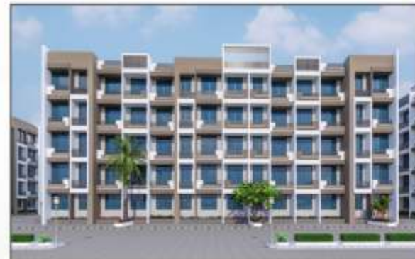
Nakshatra Residency, Saphale (W) Maha Rera Reg. No.: P99000027247