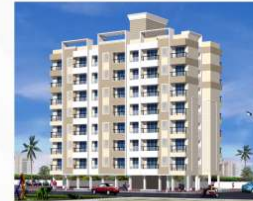
Rajlaxmi Apartment, Vasai (E) Pre - Rera Project