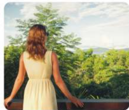
Natural Scenic Views