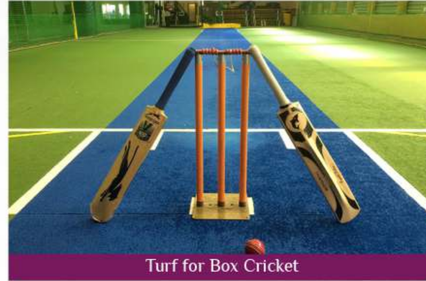
Turf for Box Cricket