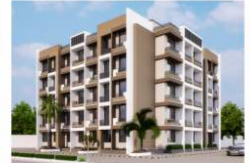
Priti Chaaya, Saphale (W) Maha Rera Reg. No.: P99000024244