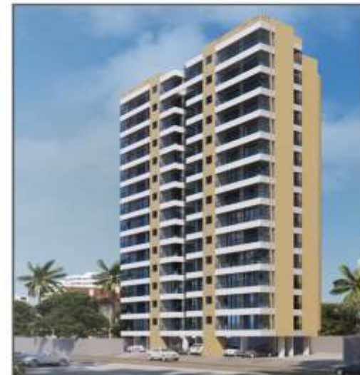
Nakshatra Tower, Mira Road (E) Pre - Rera Project