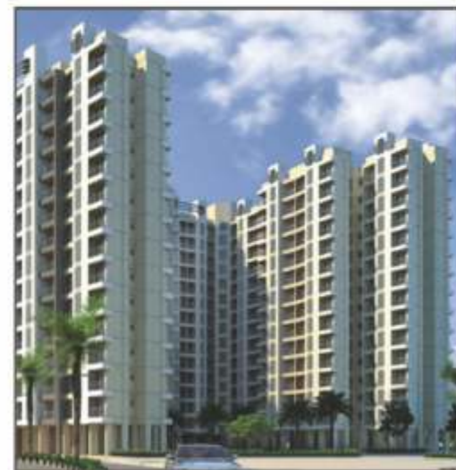
Nakshatra Primus, Naigaon (E) Maha Rera Reg. No.: P99000006041