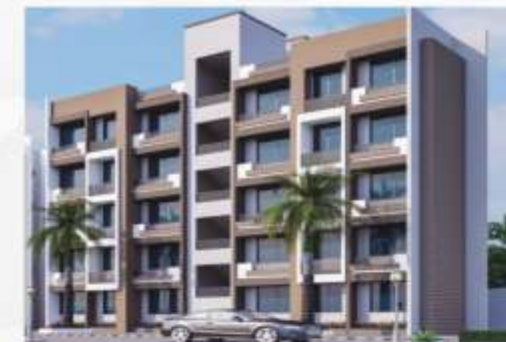
Priti Darpan, Saphale (W) Maha Rera Reg. No.: P99000022395