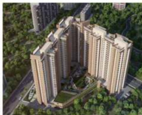
Nakshatra Veda I & II, Vasai (E) Maha Rera Reg. No.: P99000047826 / P99000048852