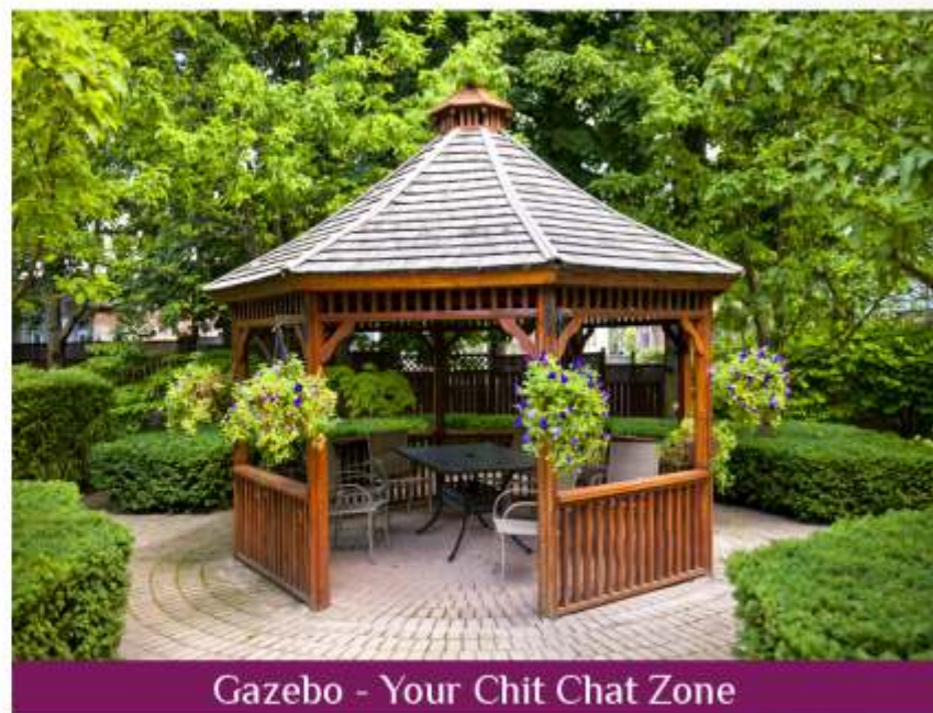
Gazebo - Your Chit Chat Zone