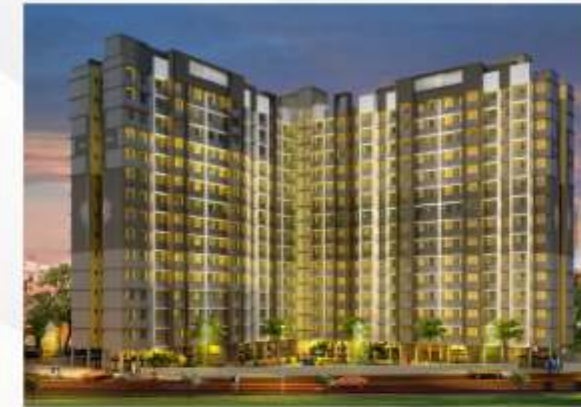
Raajlaxmi Tower, Vasai (E) Maha Rera Reg. No.: P99000022706