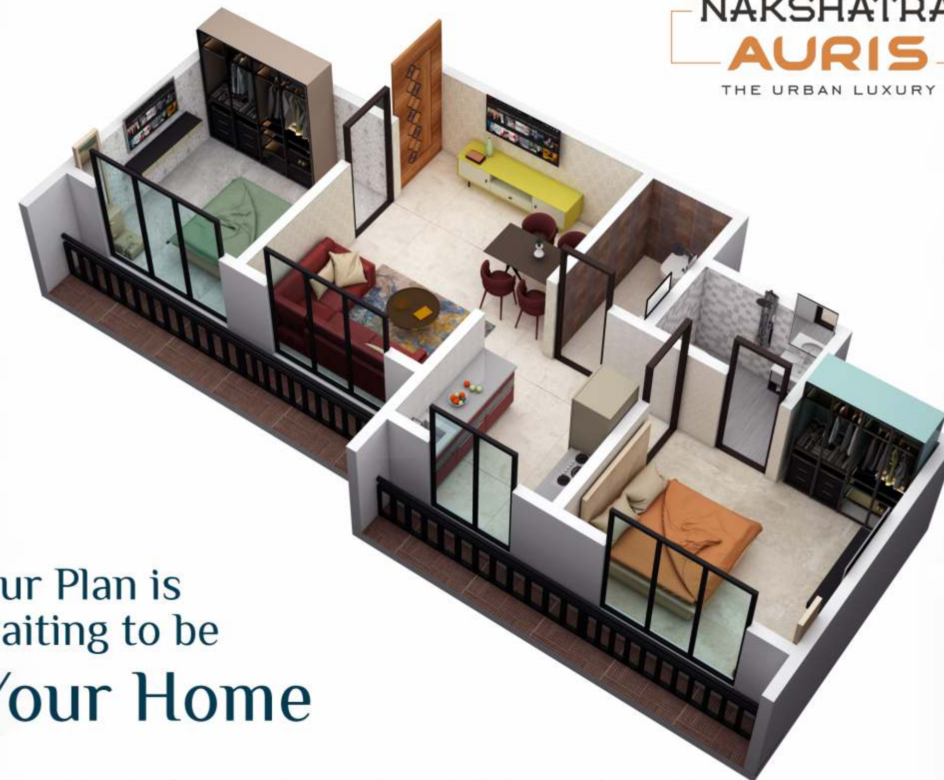
2BHK - 3D View