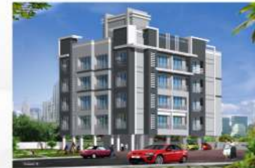
Midas Enclave, Nallasopara (E) Maha Rera Reg. No. P99000008488