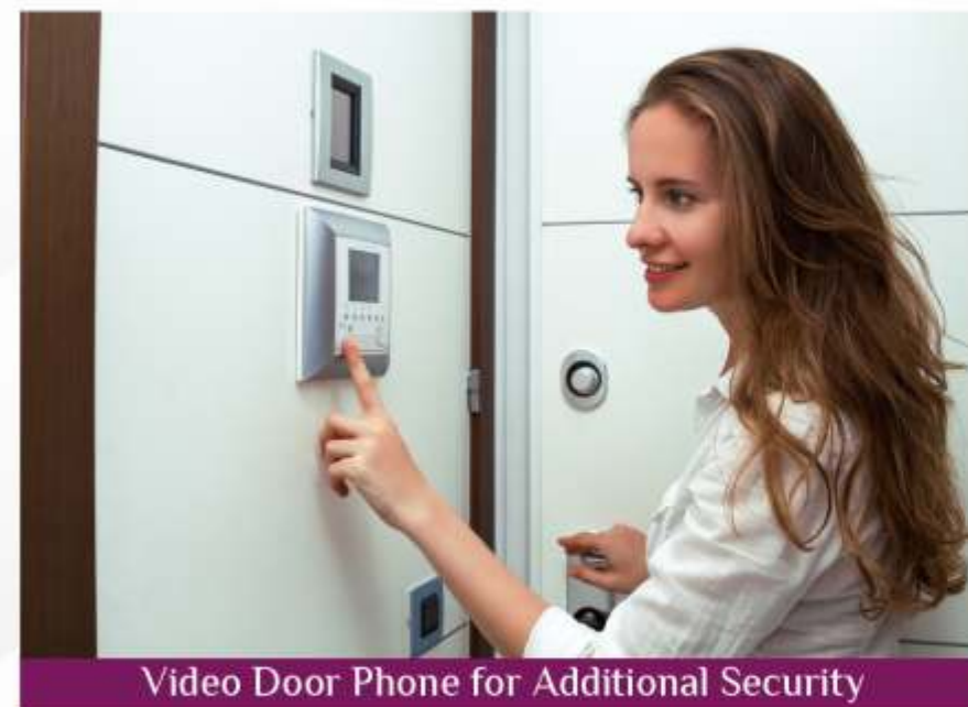
Video Door Phone for Additional Security