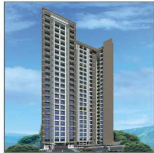
Current Project : Nakshatra Pride, Naigaon (E) Maha Rera Reg. No.: P99000017763 / P99000017789