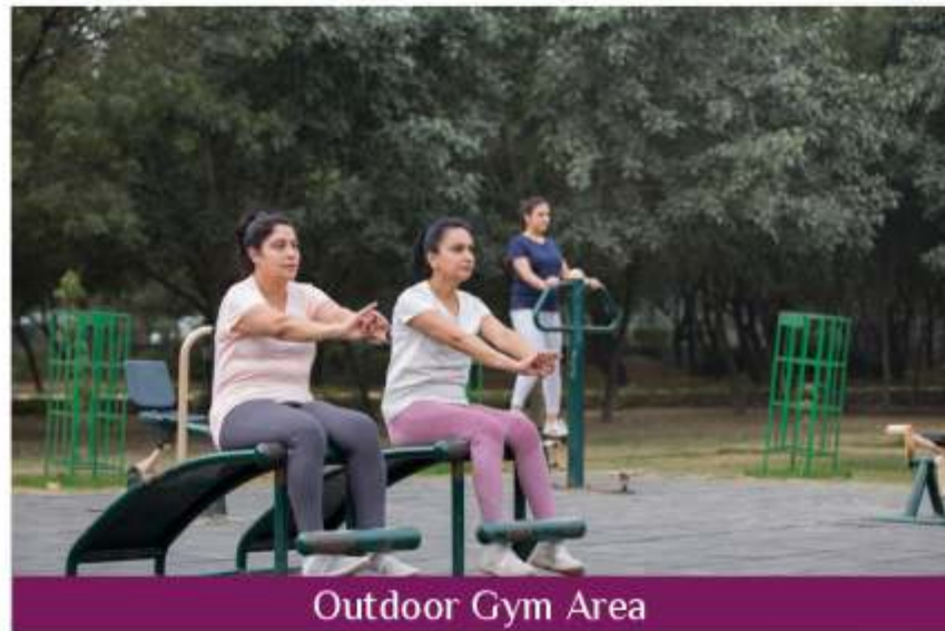
Outdoor Gym Area