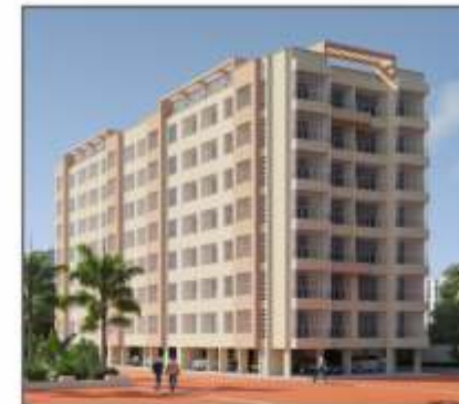
Garden Court, Bhayander (W) Pre - Rera Project