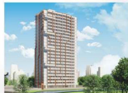
Nakshatra Trident, Virar (W) Maha Rera Reg. No.: P99000032964