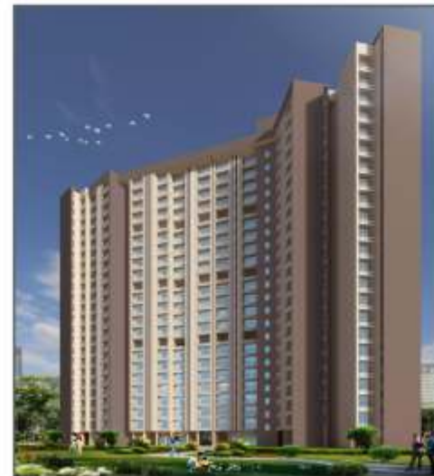
Current Project Nakshatra Aarambh, Naigaon (E) Maha Rera Reg. No.: P99000027563