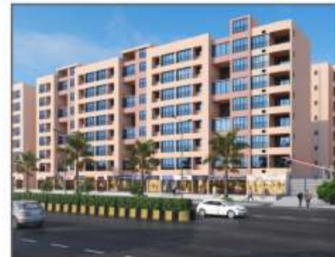
Ritu Paradise, Mira Road (E) Pre - Rera Project