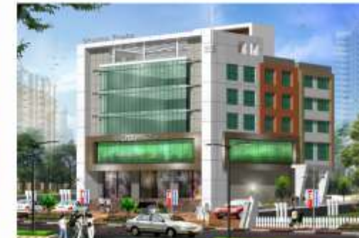
Pushp Plaza, Virar (E) Pre - Rera Project