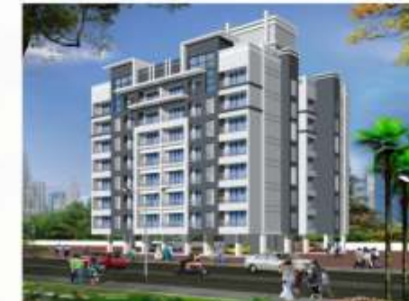
Midas Glory, Nallasopara (E) Maha Rera Reg. No. P99000006814