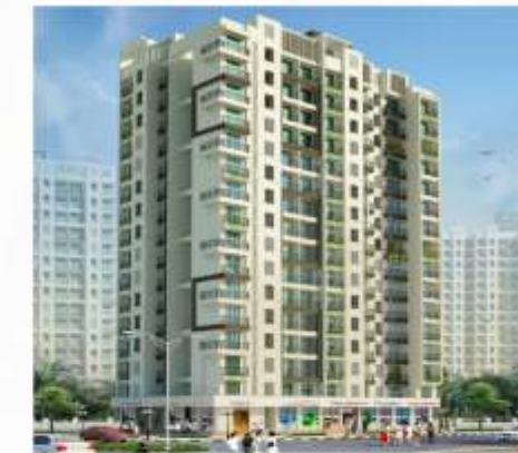
Midas Heights, Virar (W) Maha Rera Reg. No. P99000011085