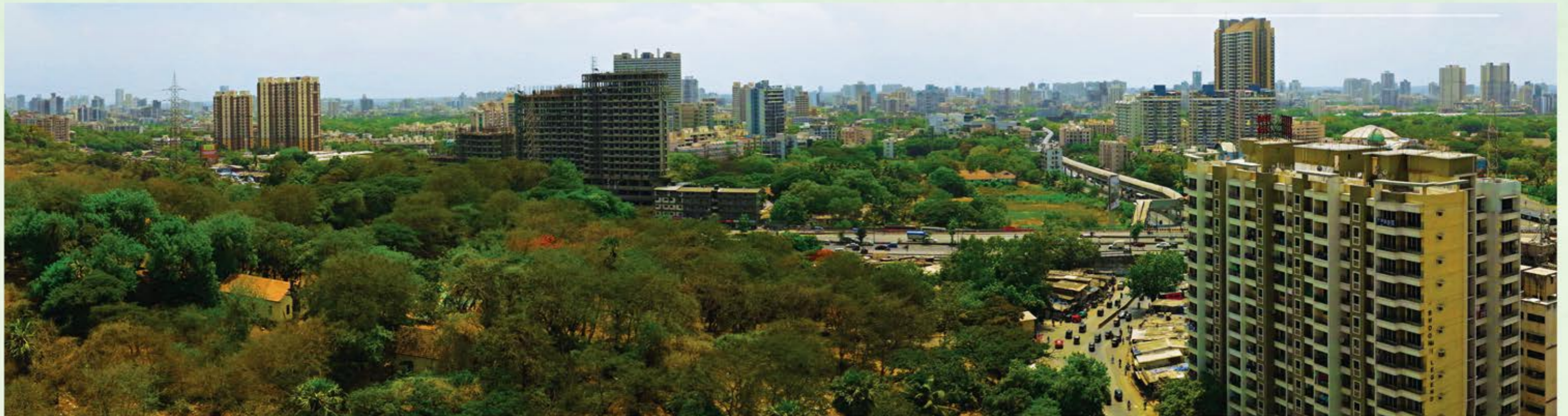
▲ Sports Authority of India view from site