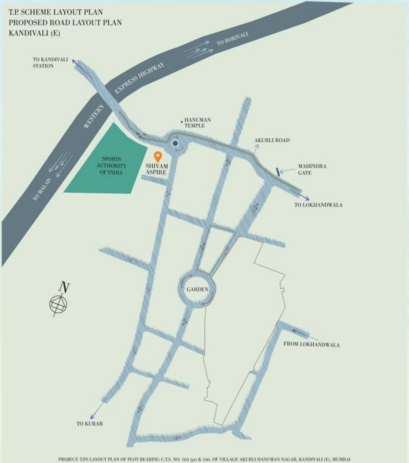
PROJECT T.P.S LAYOUT PLAN OF PLOT BEARING C.T.S. NO. 163 (pt) & 166. OF VILLAGE AKURLI HANUMAN NAGAR, KANDIVALI (E), MUMBAI

T.P. SCHEME LAYOUT PLAN PROPOSED ROAD LAYOUT PLAN KANDIVALI (E)