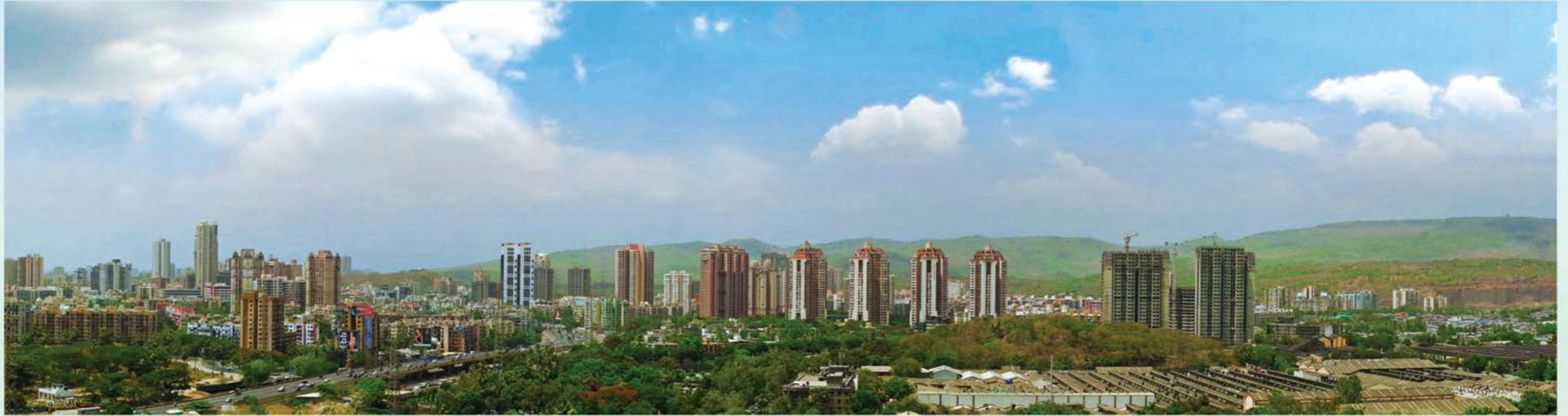
▲ Sanjay Gandhi National Park view from site

With its cosmopolitan lifestyle, thriving business community and fascinating skylines, Kandivali has taken its place amongst the premium locations in Mumbai.