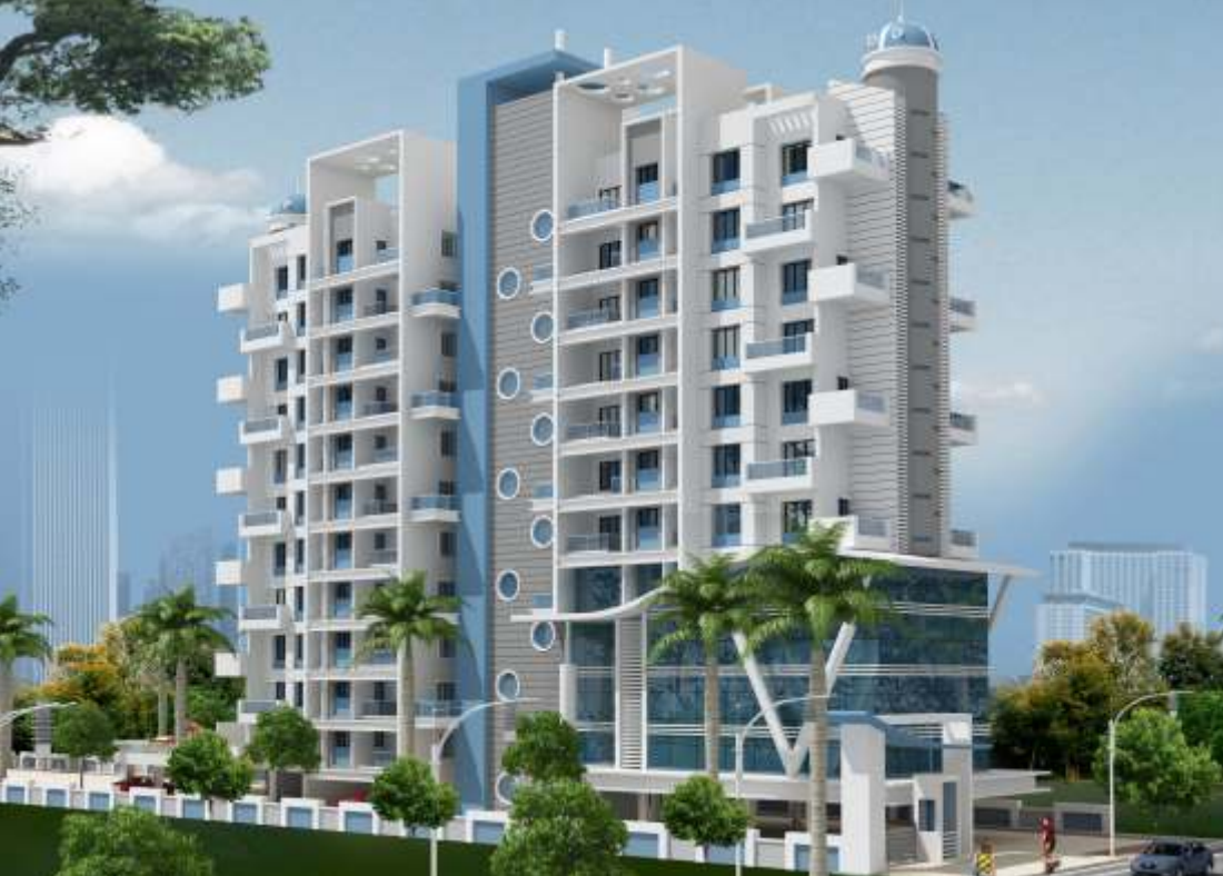
A - Building