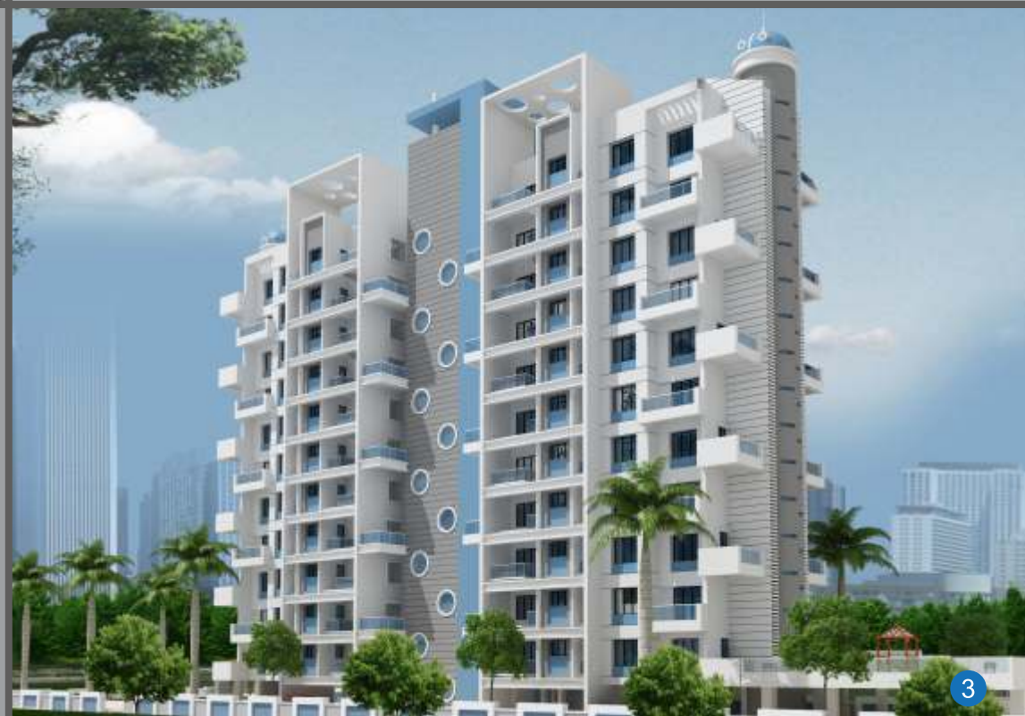
B - Building