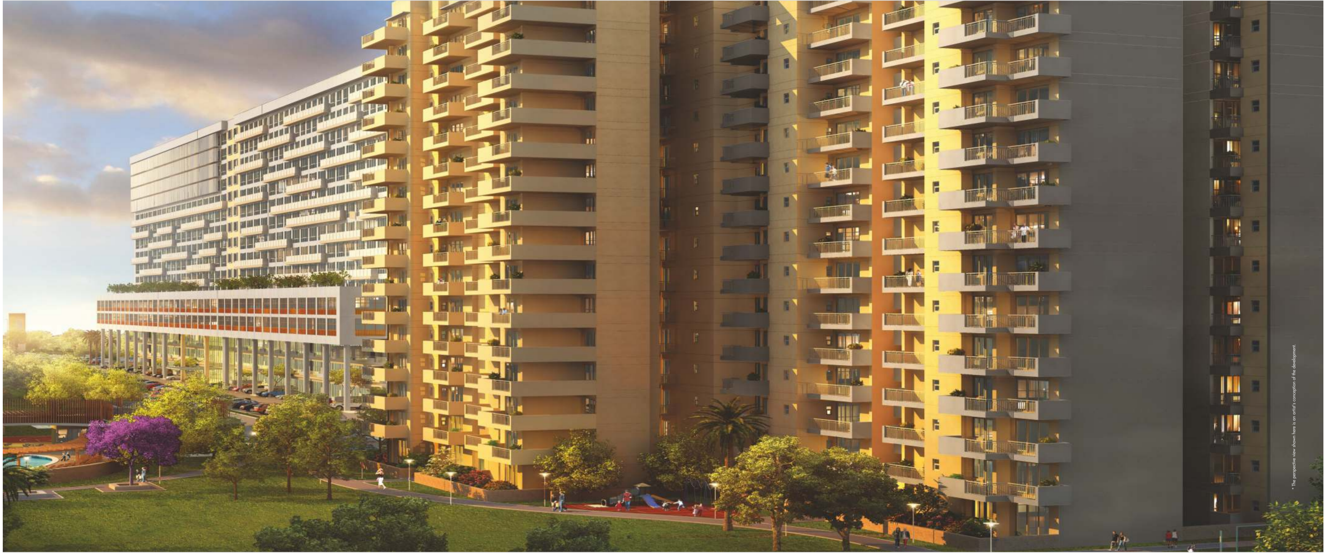
* The perspective view shown here is an artist's conception of the development.