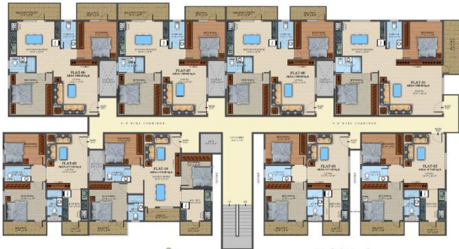
BLOCK - C