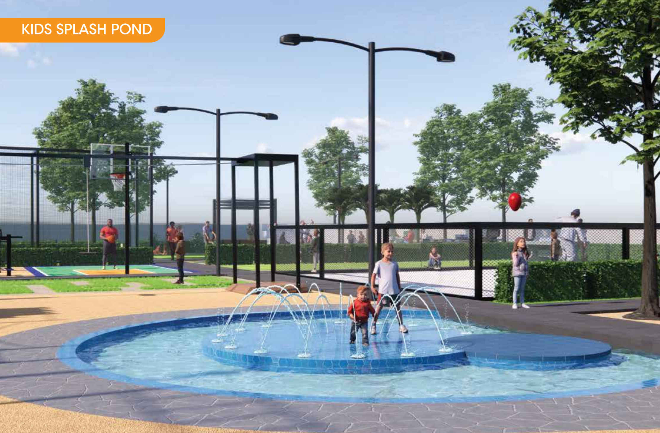
KIDS SPLASH POND