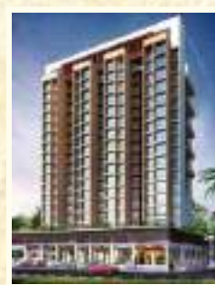
SAI PROVISO SAPPHIRE Kalamboli