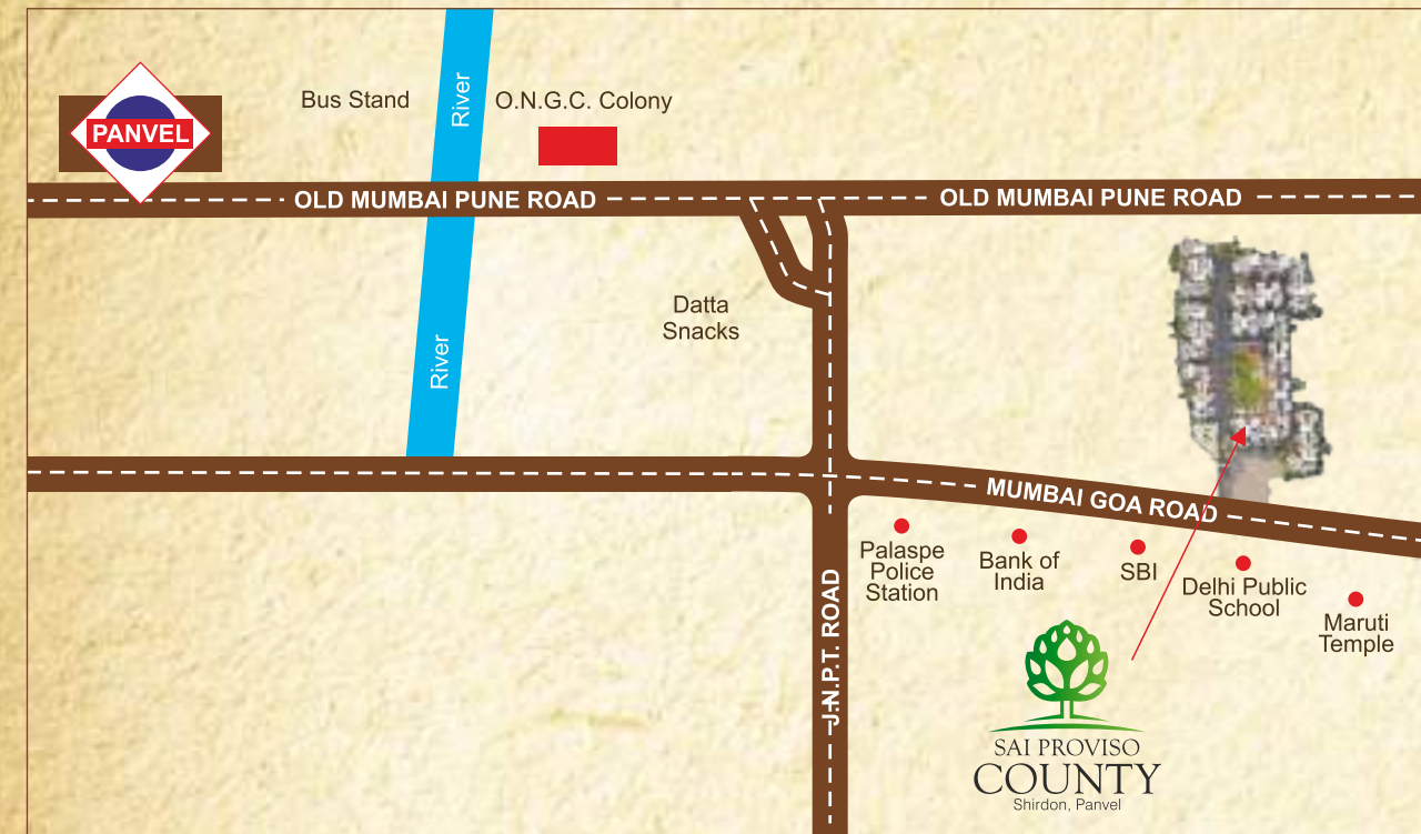
Location Map (Not to scale)

Site Add.: Plot No. 154/1, 154/3, 162/3, 188/2, Village - Shirdon, Taluka - Panvel, Dist. Raigad.