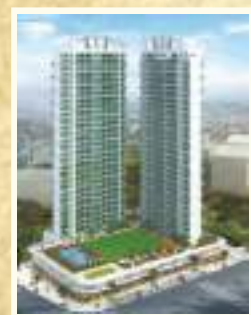
GREEN WOODS Kharghar