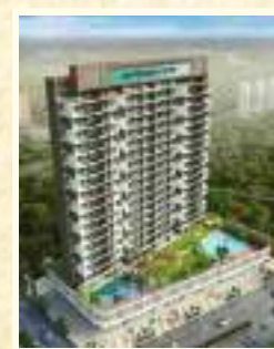
SAI PROVISO ICON Roadpali