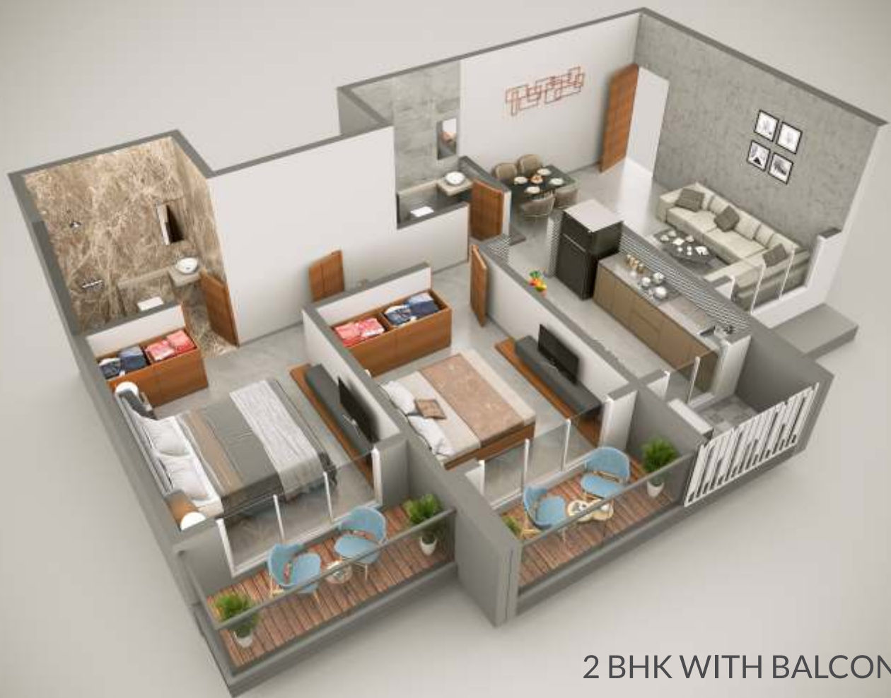
2 BHK WITH BALCONY