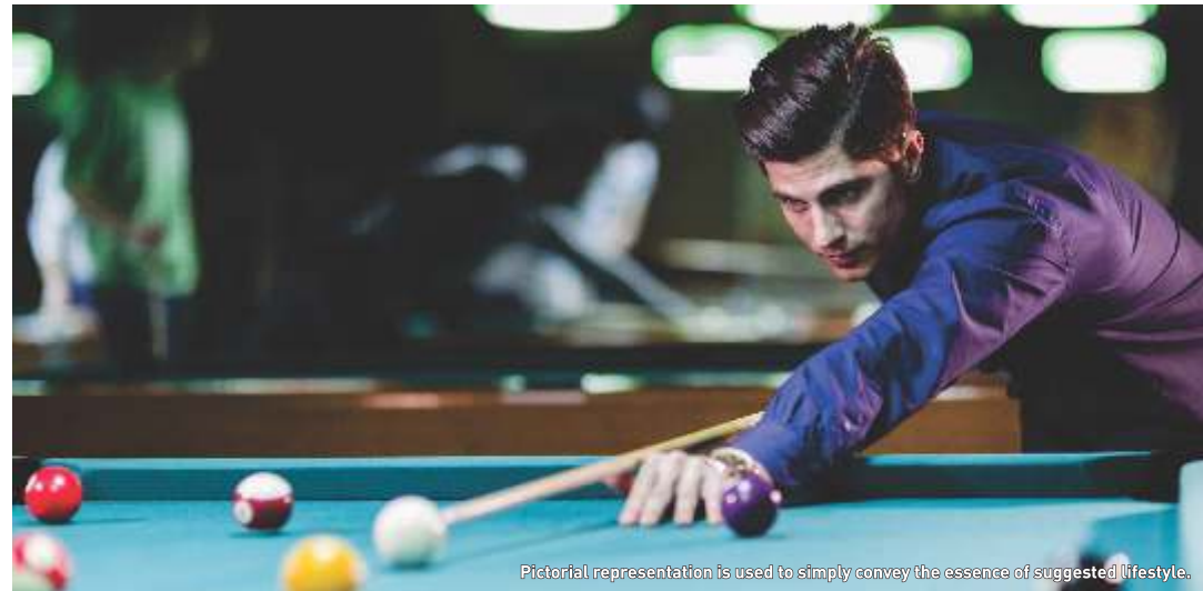
Pictorial representation is used to simply convey the essence of suggested lifestyle.