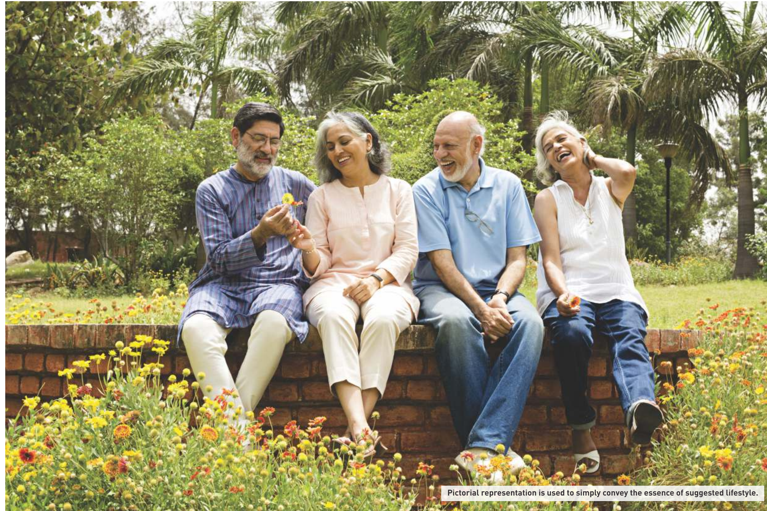
Pictorial representation is used to simply convey the essence of suggested lifestyle.