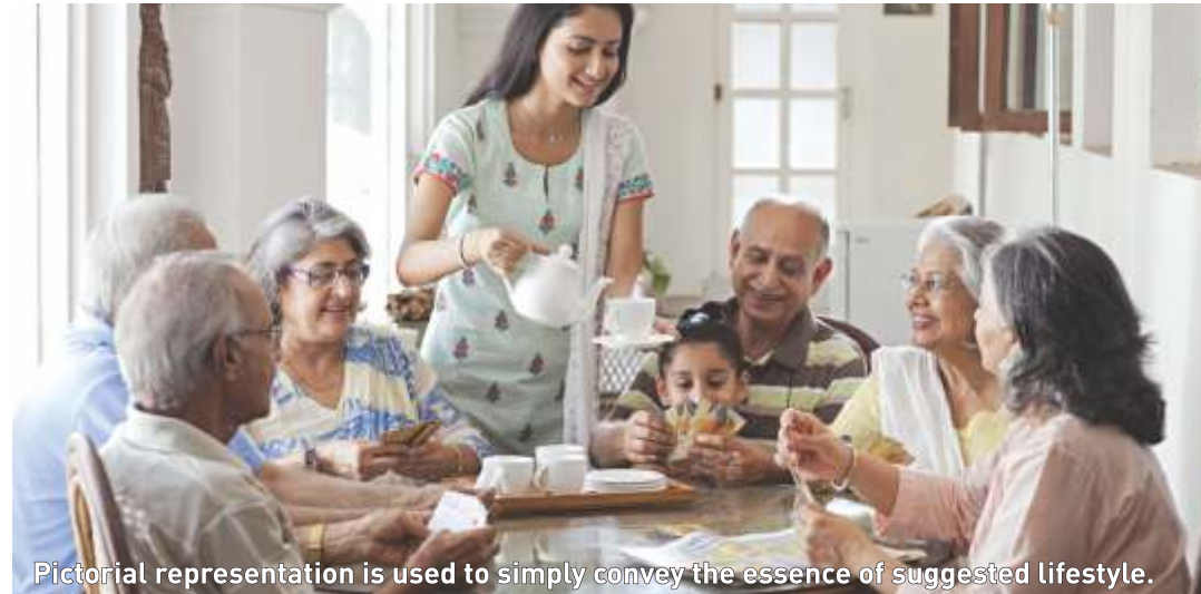
Pictorial representation is used to simply convey the essence of suggested lifestyle.