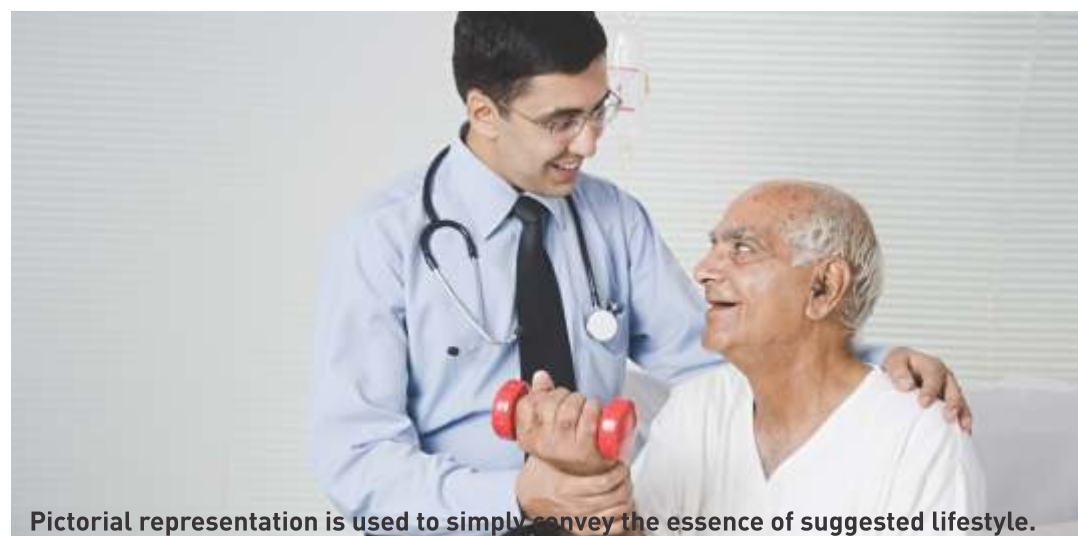
Pictorial representation is used to simply convey the essence of suggested lifestyle.