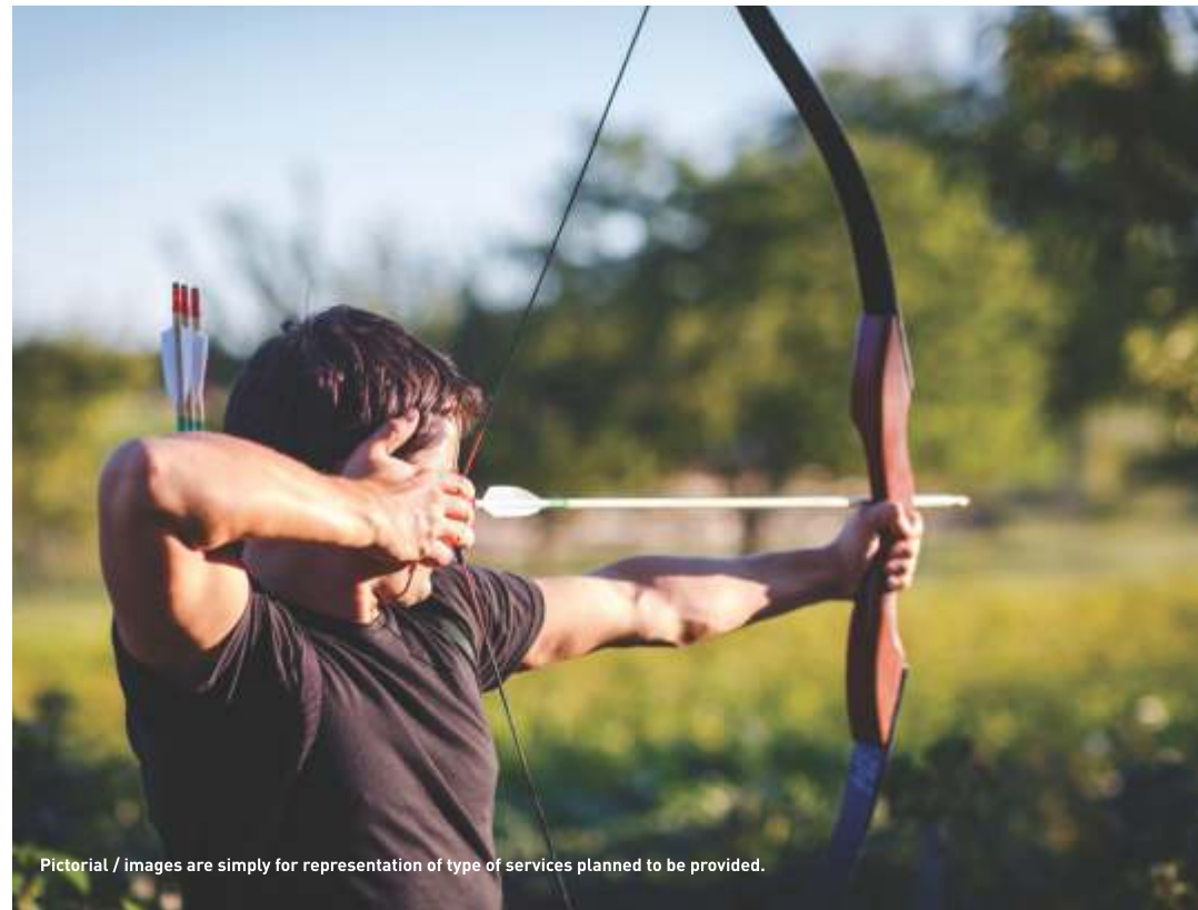
Pictorial / images are simply for representation of type of services planned to be provided.