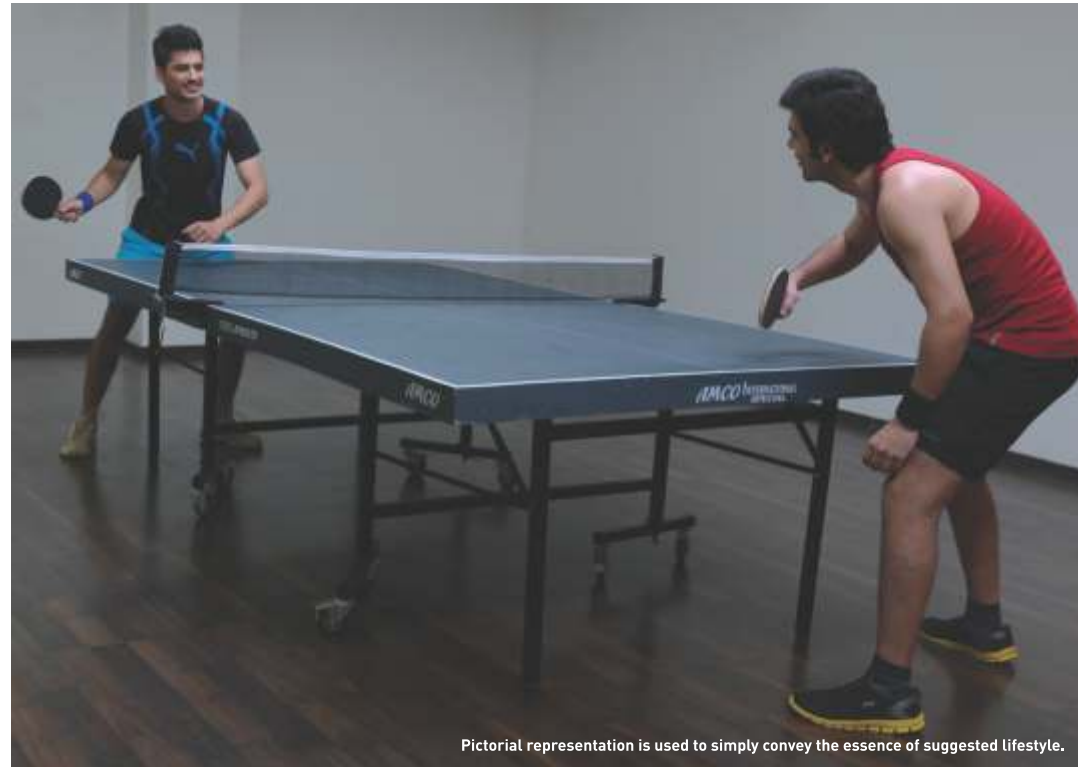
Pictorial representation is used to simply convey the essence of suggested lifestyle.