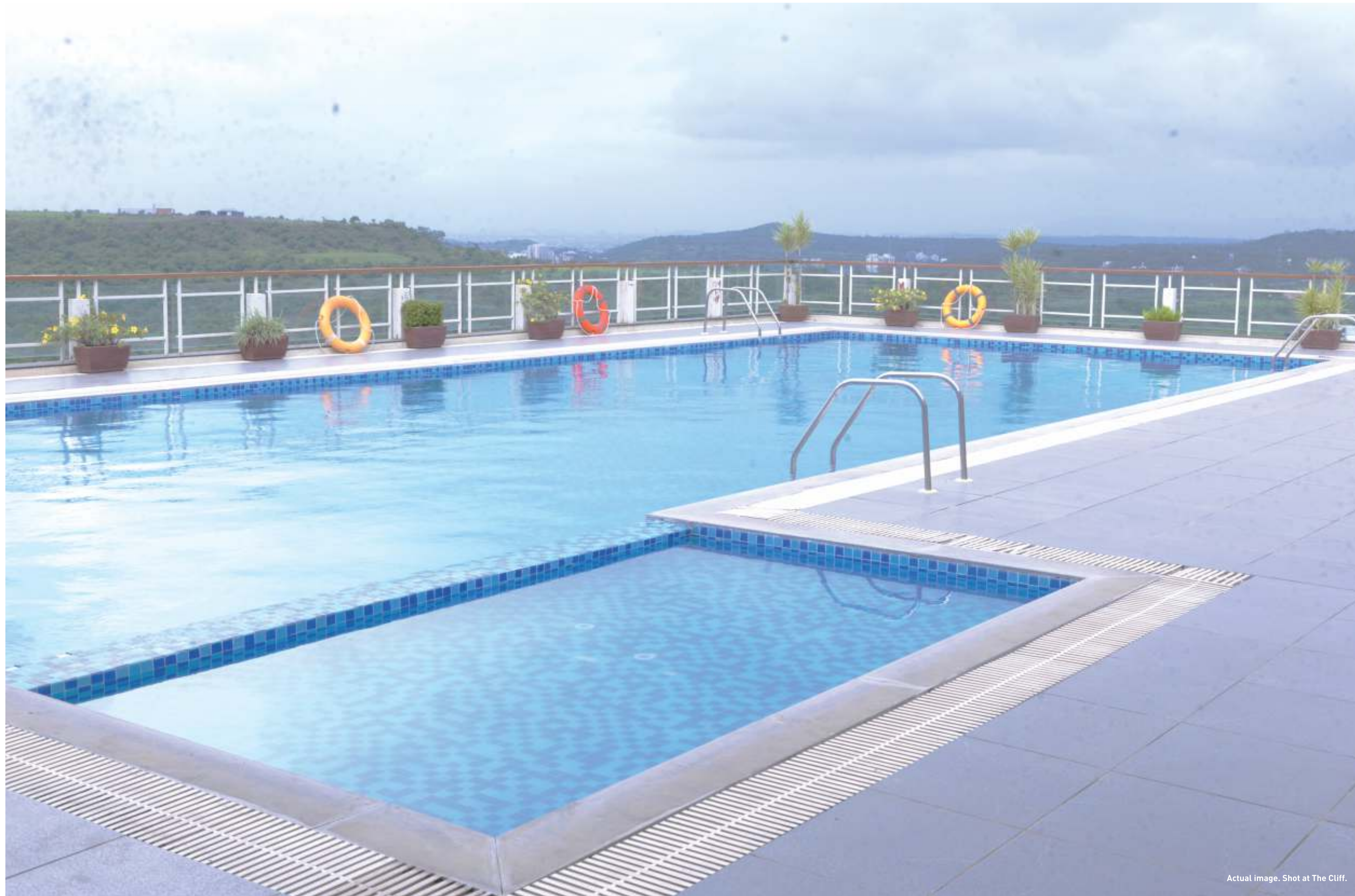
Actual image. Shot at The Cliff.