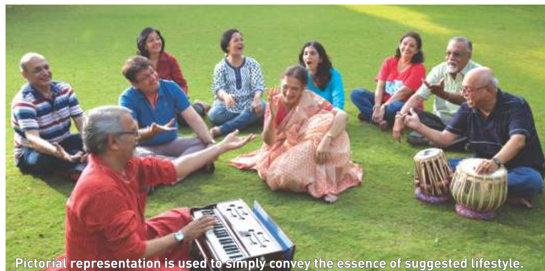
Pictorial representation is used to simply convey the essence of suggested lifestyle.