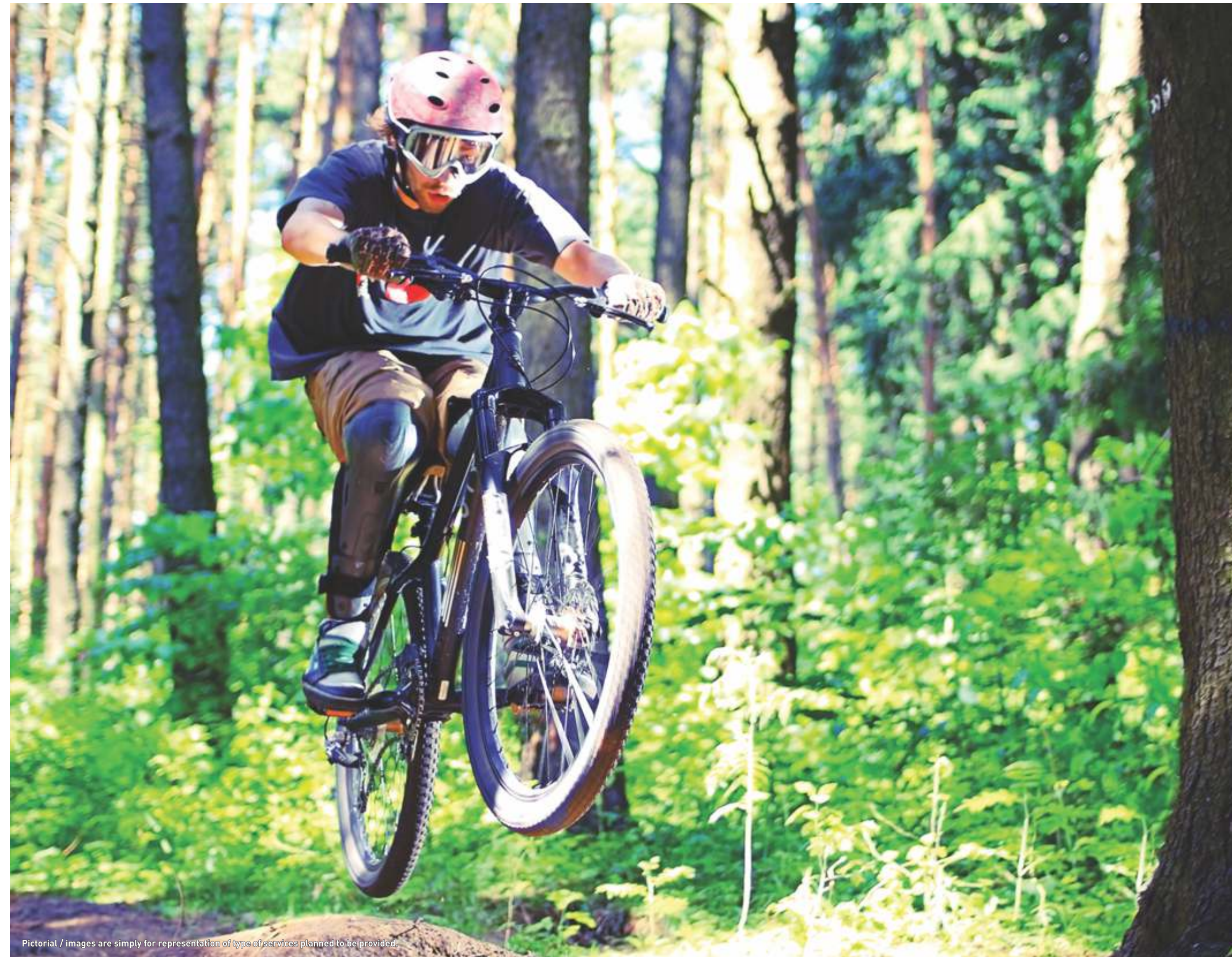
Pictorial / images are simply for representation of type of services planned to be provided.