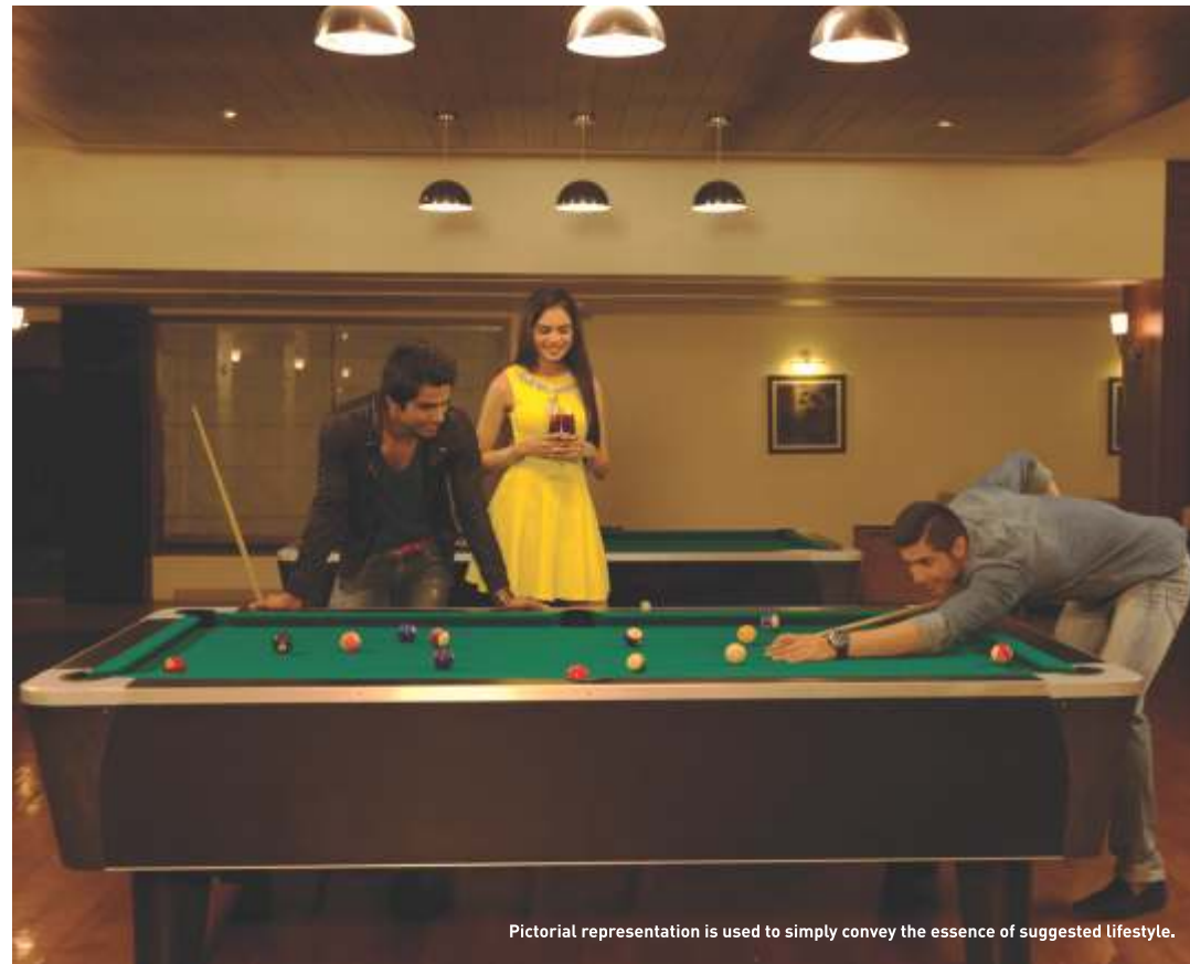
Pictorial representation is used to simply convey the essence of suggested lifestyle.