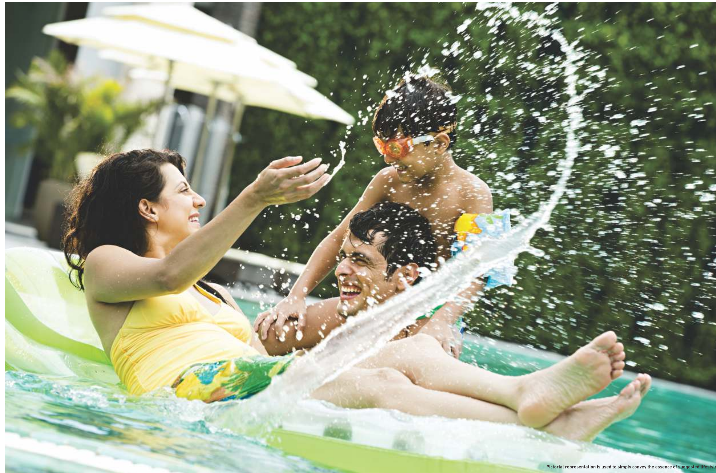
Pictorial representation is used to simply convey the essence of suggested lifestyle.