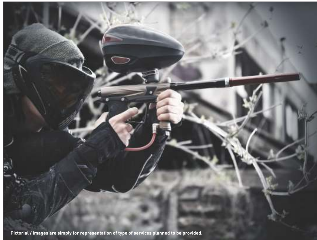
Pictorial / images are simply for representation of type of services planned to be provided.