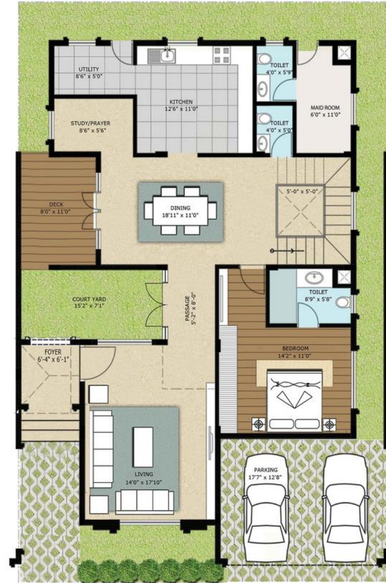
◆ GROUND FLOOR PLAN ◆