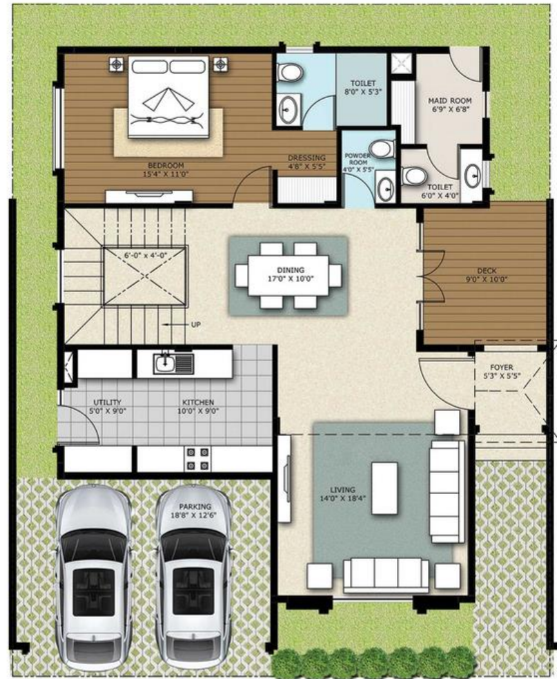
◆ GROUND FLOOR PLAN ◆