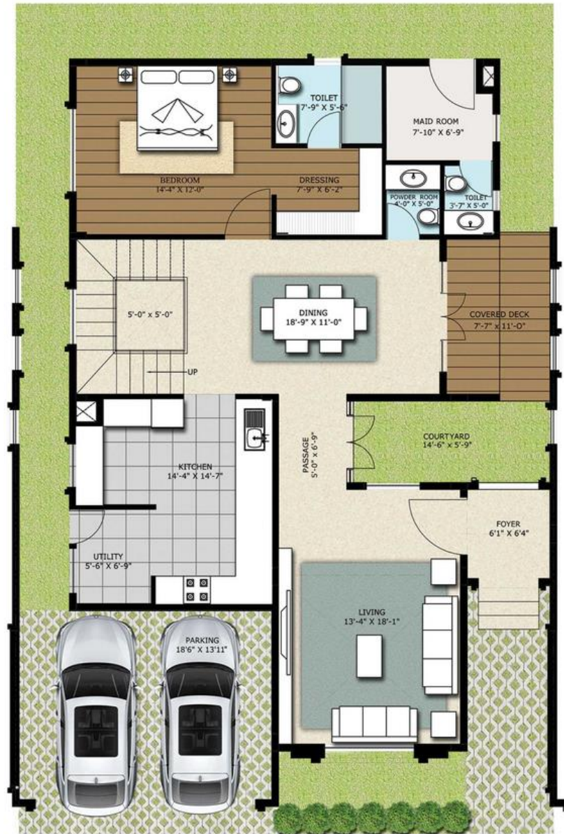
◆ GROUND FLOOR PLAN ◆