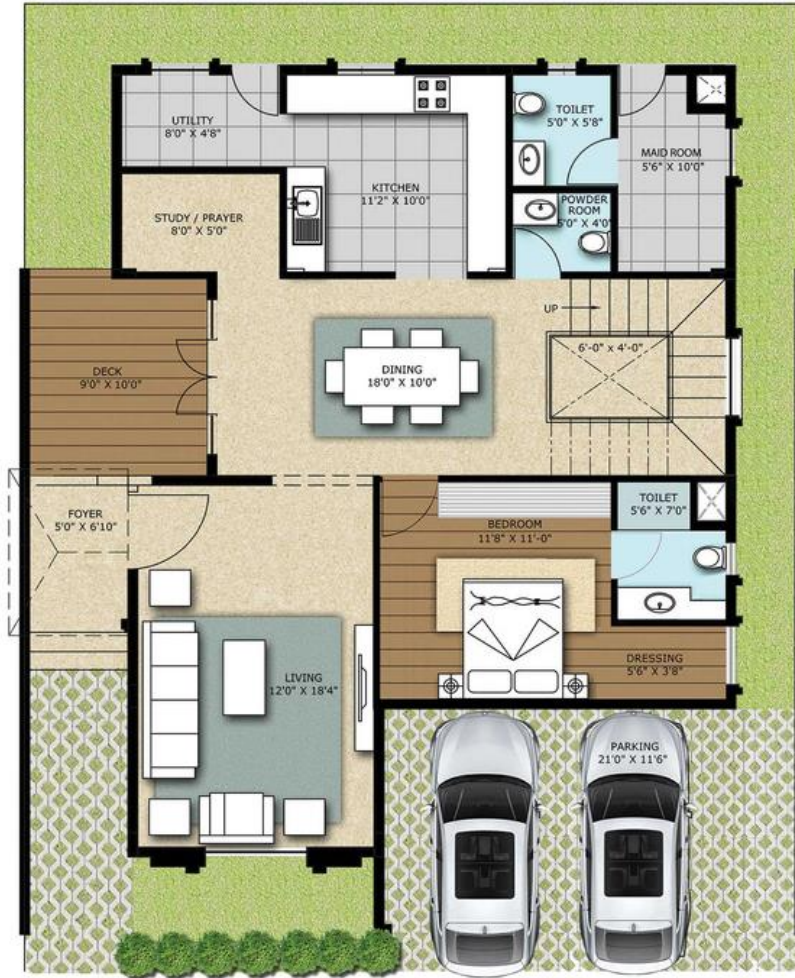
◆ GROUND FLOOR PLAN ◆