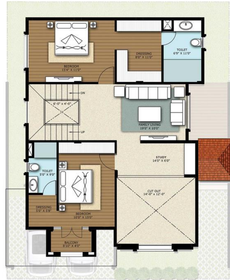
◆ FIRST FLOOR PLAN ◆