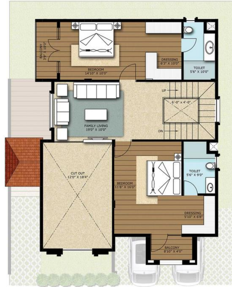
◆ FIRST FLOOR PLAN ◆