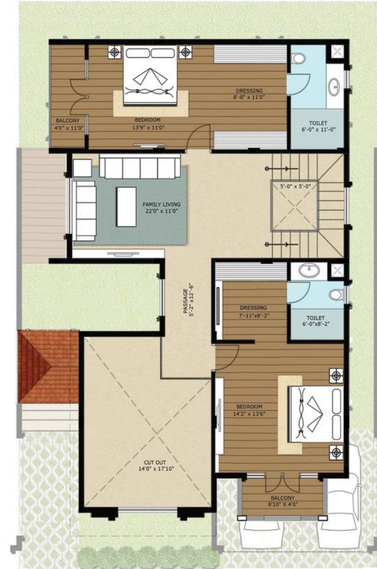
◆ FIRST FLOOR PLAN ◆