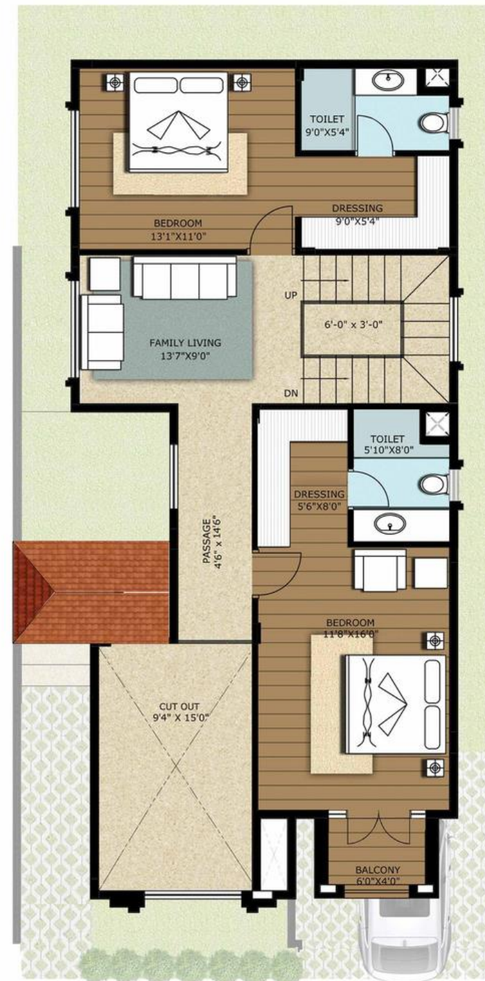
◆ FIRST FLOOR PLAN ◆