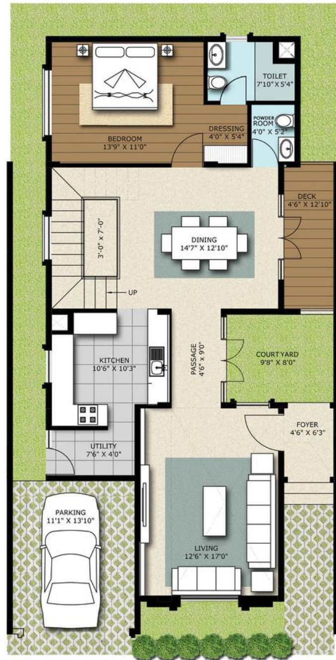
◆ GROUND FLOOR PLAN ◆