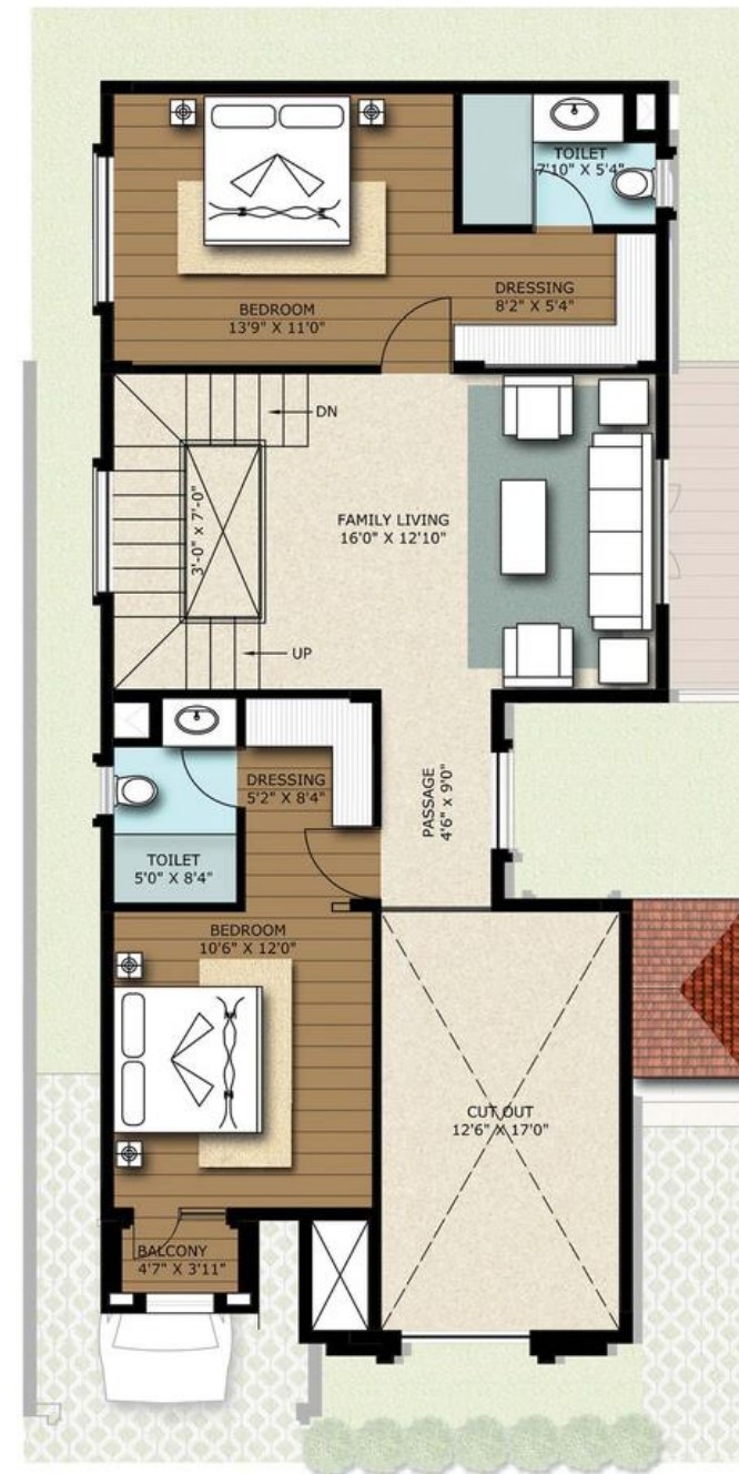
◆ FIRST FLOOR PLAN ◆