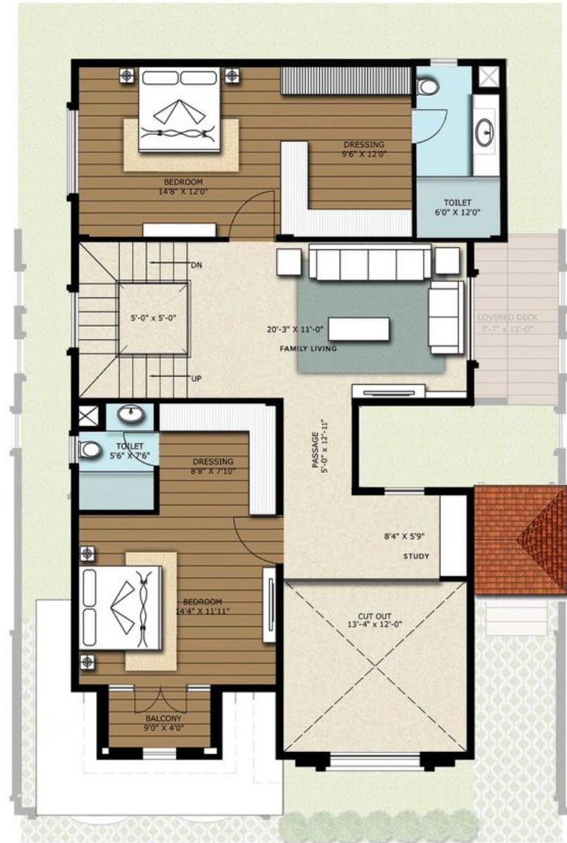
◆ FIRST FLOOR PLAN ◆