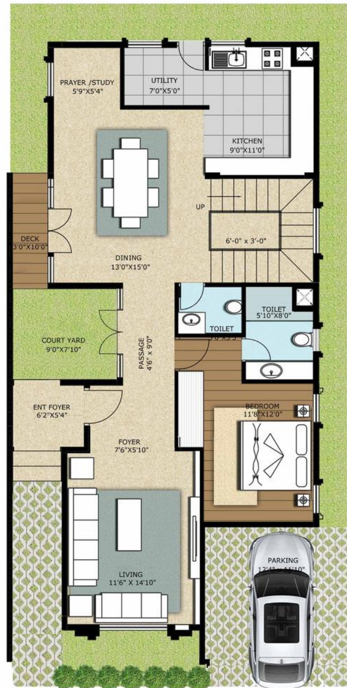
◆ GROUND FLOOR PLAN ◆