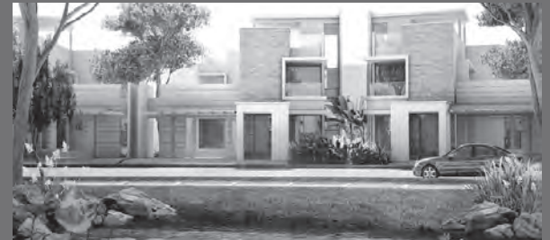
Sterling Villa Grande