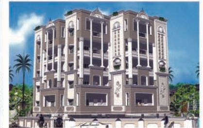
D.N.R. Residency at Venkojipalem