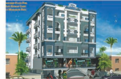
Raja Sagi Residency - Grand Bay Hotel Road