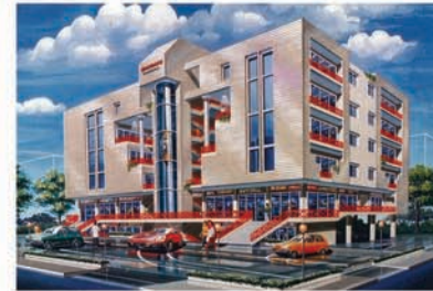
Bharat Towers at Dwarakanagar Nagar