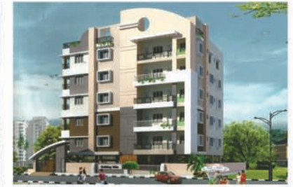
Sai Srinivasam - East Point Colony