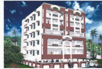
Sai Krishna Towers - Venkojipalem