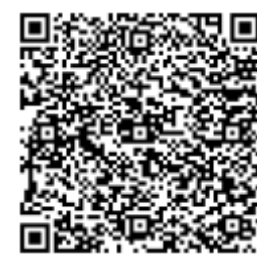
SCAN QR FOR LOCATION

Disclaimer: Every reasonable care has been taken while preparing this brochure. However, the developer/promoter and its agents shall not be held responsible or liable for any inaccuracy. All representations are believed to be correct and as envisaged / promoter. However, since the project is under evolution there is a possibility that, there may be certain in the representation made in this brochure. All art renderings, illustration, photographs and picture contained in artist's impression only and the same should not be construed to be the final images/ views of the final project.