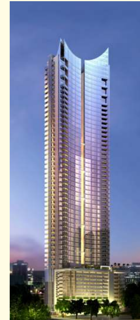
Ahuja Towers - Worli