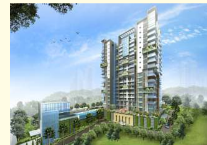
Project in Bandra

Upcoming Projects - Malad | Bandra | Khar | Wadala