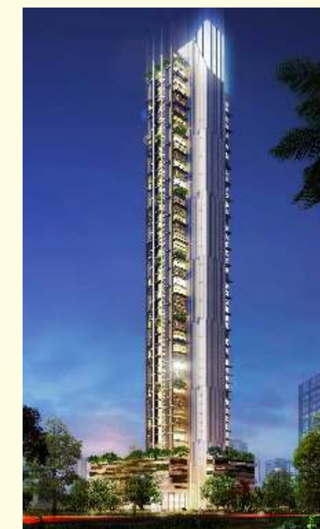
Altus - Worli