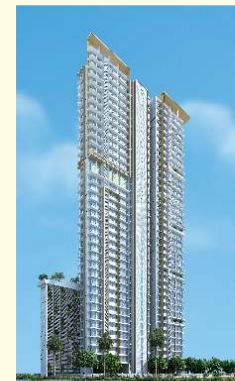
L'Amor - Oshiwara