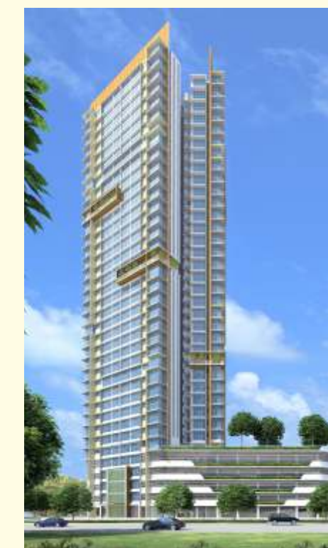
Maple View - Malad