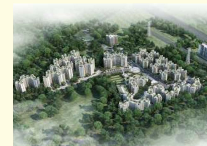
Prasadam - Ambarnath (E)