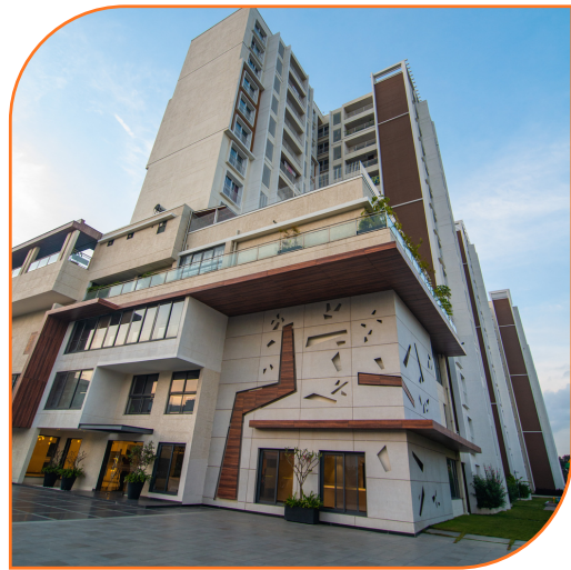
SNN RAJ Grandeur

Electronic City Phase II, Off Hosur Road