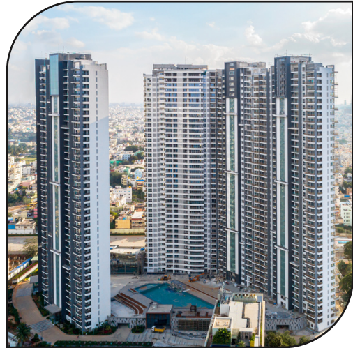
SNN RAJ Clermont