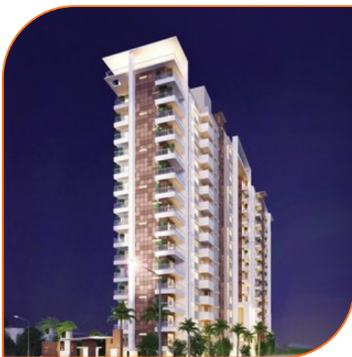
SNN RAJ Spiritua