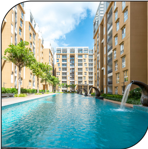
SNN RAJ Greenbay

Electronic City Phase II, Off Hosur Road