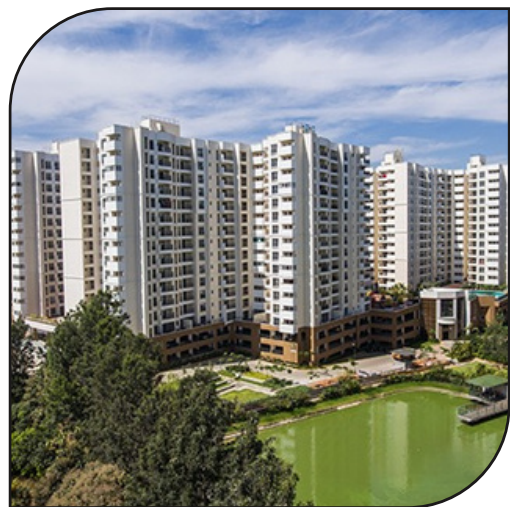
SNN RAJ Serenity