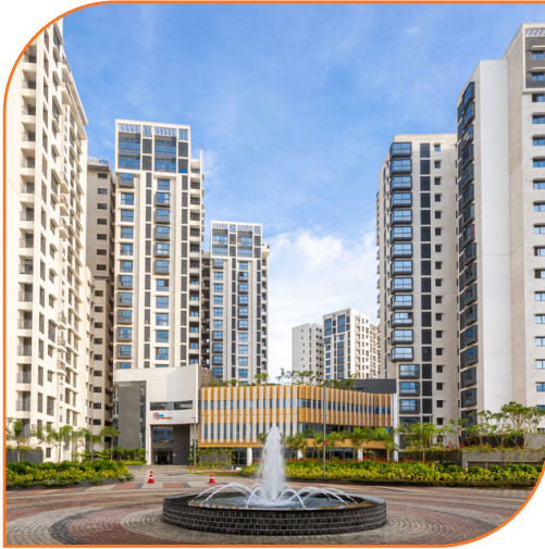
SNN RAJ Eternia