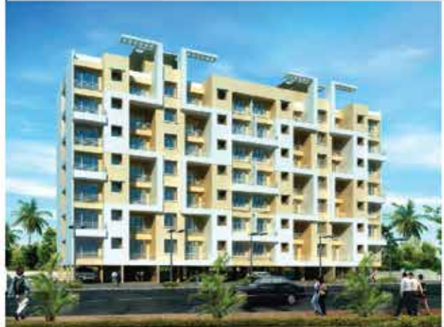
Queens Court, Kalyan