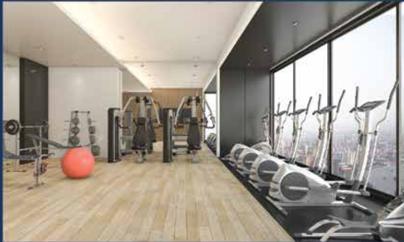
Clubhouse with Gym