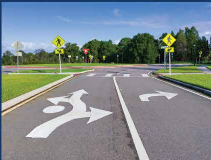
Spacious and landscaped Entrance Driveway