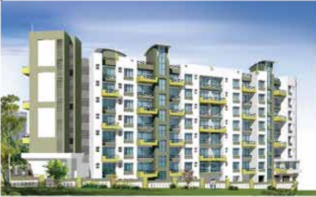
Shreenathji Tower, Kalyan west