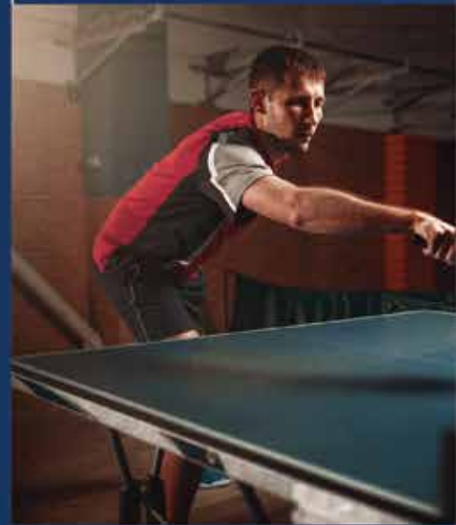
Indoor Games Room