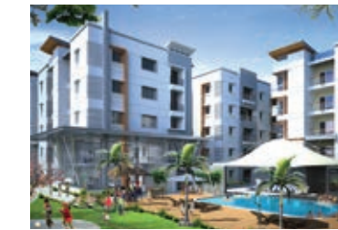
NCC Urban Park Square, Near Swami Theatre