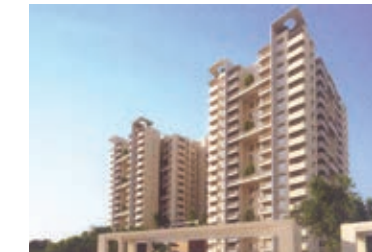
Nagarjuna Ivory Heights, Off Marathahalli - K R Puram Ring Road