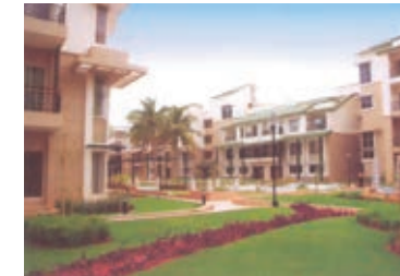
Nagarjuna Green Woods, Off Marathahalli - Sarjapur Ring Road