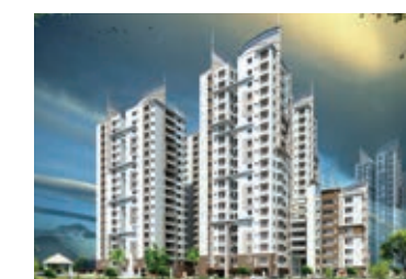
NCC Urban One, Narsingi