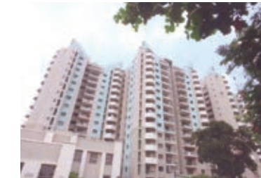
Nagarjuna Maple Height Off Marathahalli - K R Puram Ring Road