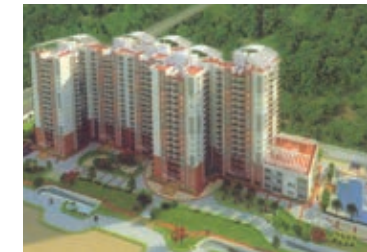
Nagarjuna Meadows Phase II, Yelahanka