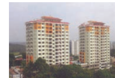
Nagarjuna Green Valley, Kakkanad