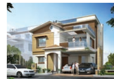
Green Province, Sarjapur