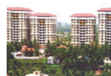
Nagarjuna Pearl Bay, Kadavantara