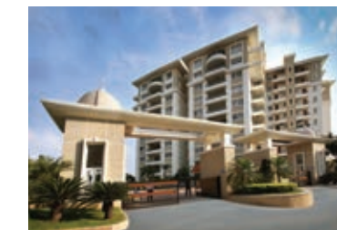
Nagarjuna Residency, Gachibowli