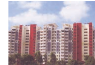
Nagarjuna Meadows Phase I, Yelahanka