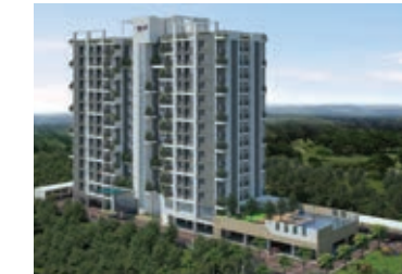
NCC Urban Senate, Kaloor