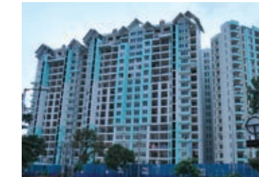
Nagarjuna Aster Park, Yelahanka