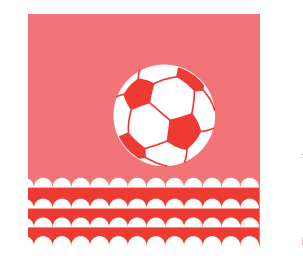
An environment of activity