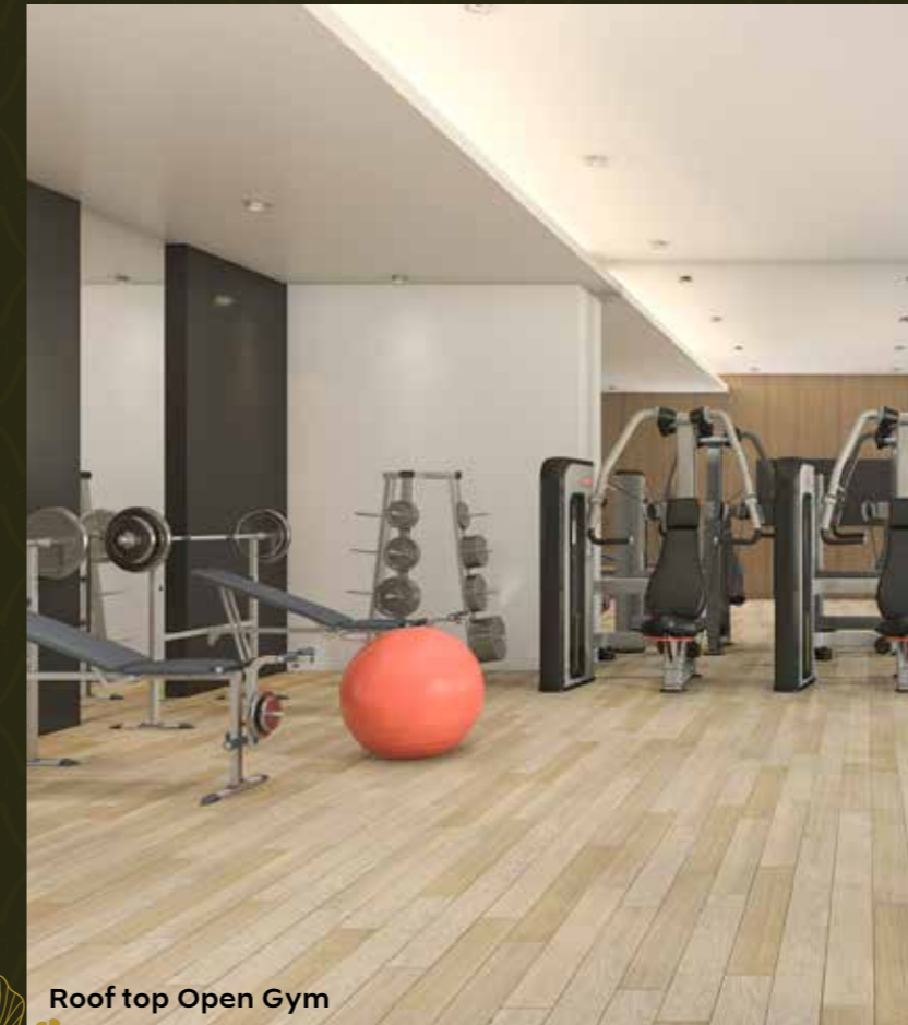
Roof top Open Gym