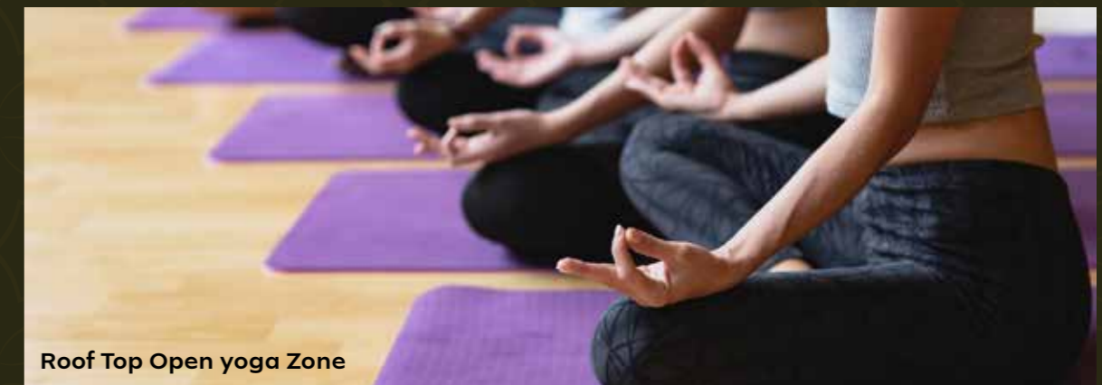
Roof Top Open yoga Zone