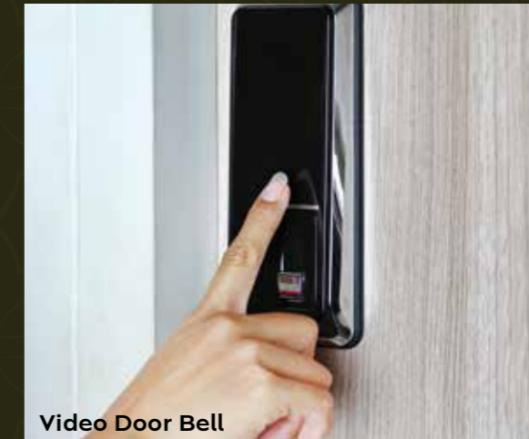
Video Door Bell