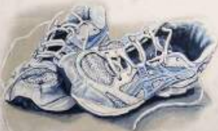
Chart your physical growth and take control of your fitness journey with our indoor and outdoor gyms. Set new records and break old ones by choosing to live a healthy life every day with state of the art gym facilities.