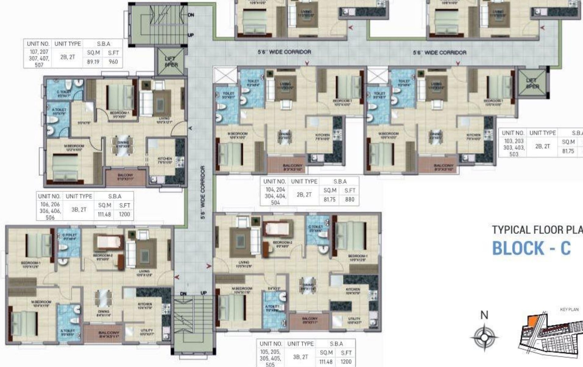
TYPICAL FLOOR PLAN BLOCK - C