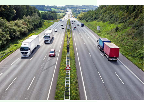
Roads & Infrastructure