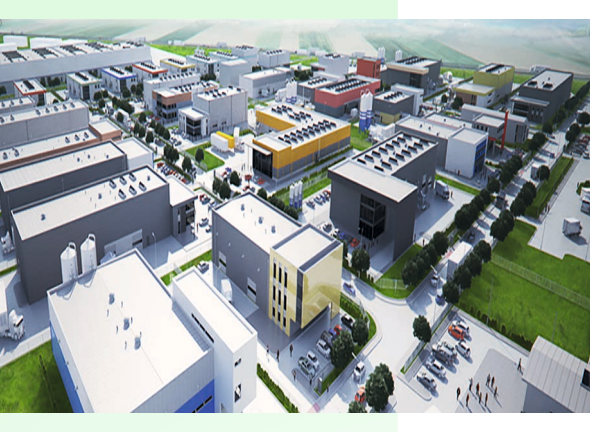
Electronic - City