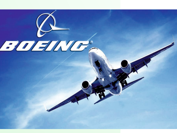
Aero Manufacturing Hub