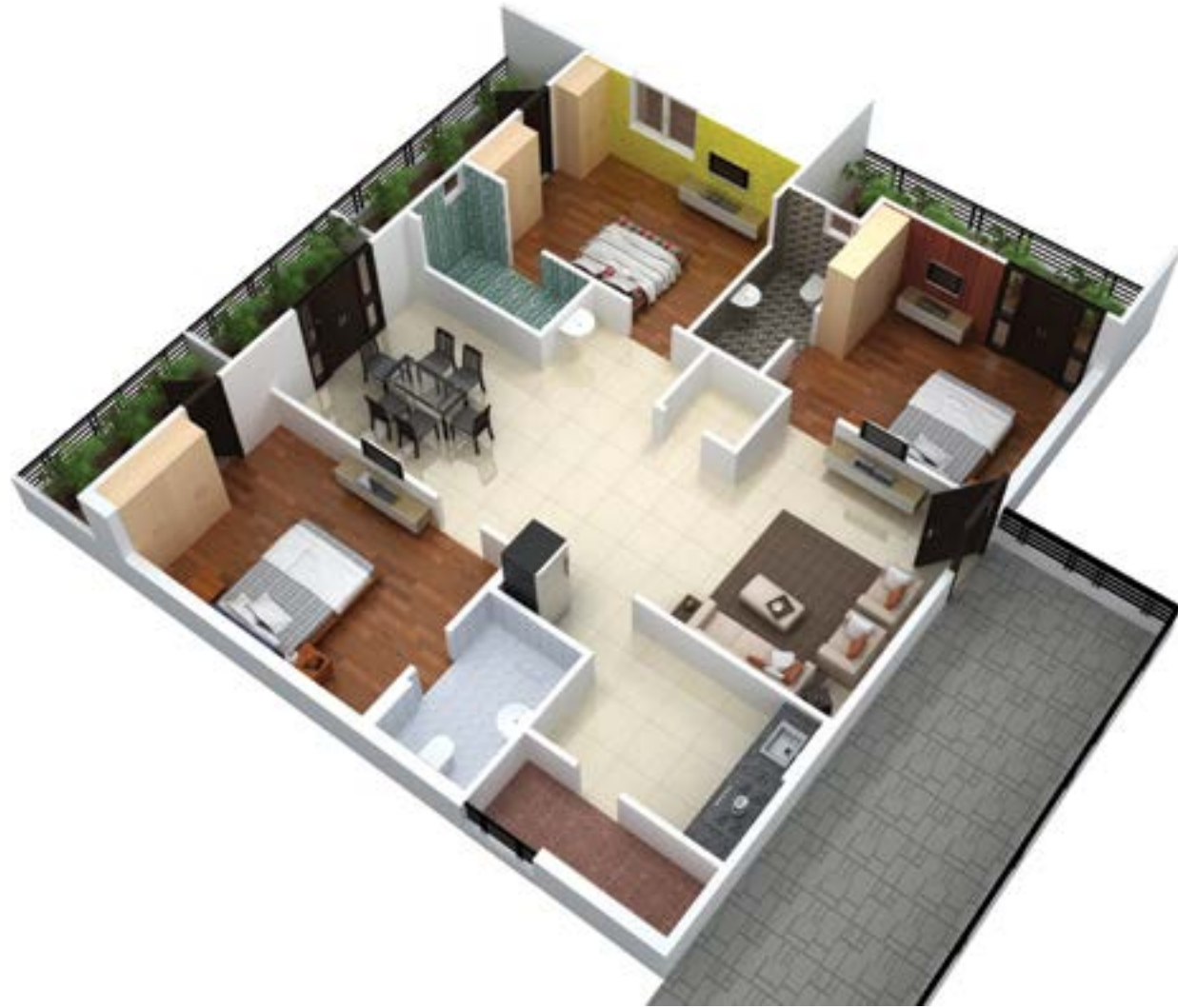
2400 Sft East Facing

Myspace offers a unique, spacious and gratifying affair to its prospective residents. Besides offering a joyous view in around, it also offers vivacious and vigorous culture too. Your decision to live in this spectacular abode will give you a sense of pride and fulfillment of a perfect place to spend the rest of your life with ease.