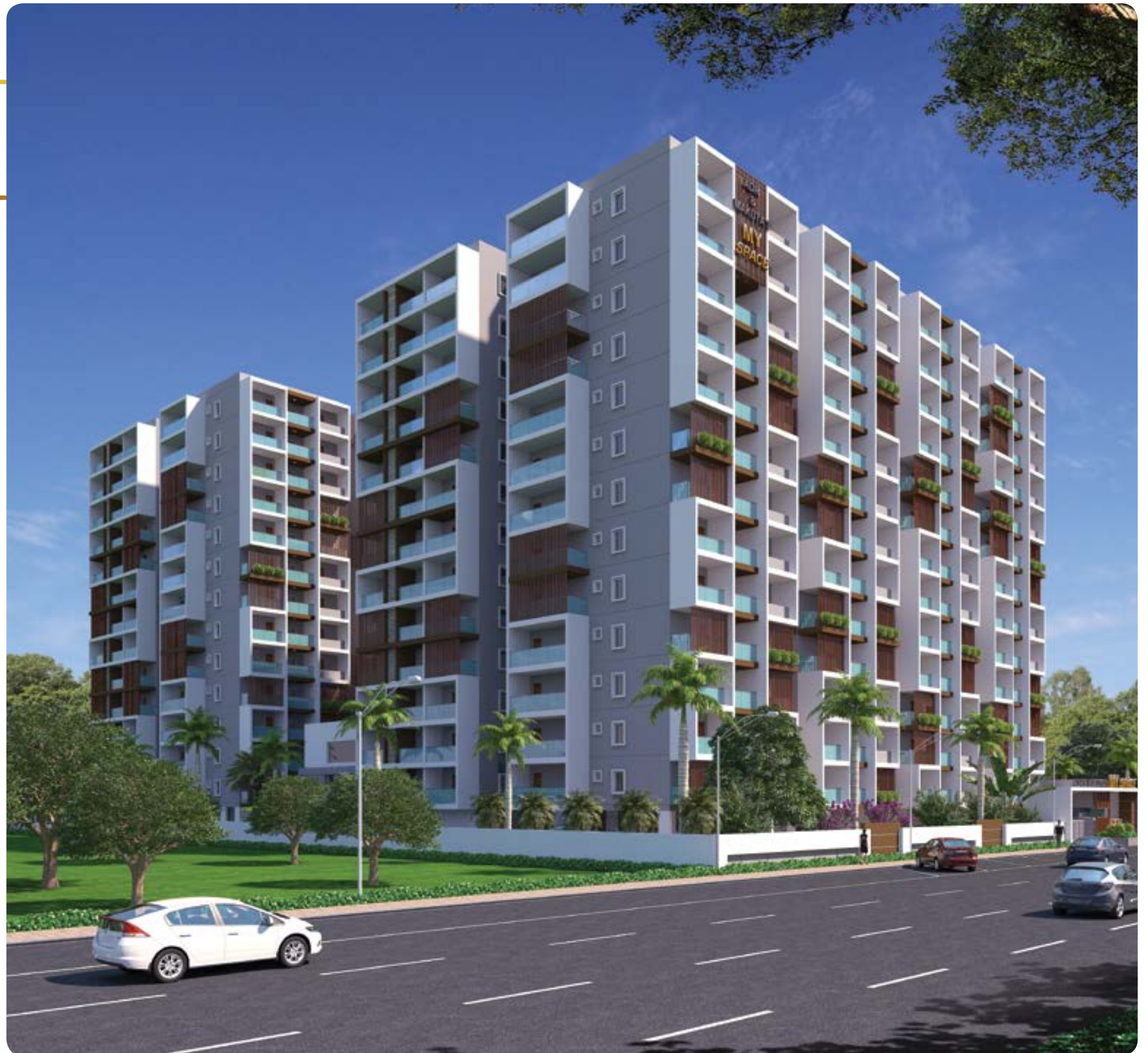
South West View

Built to suit your elite preferences, Myspace brings the fullness of smart residence at an affordable price. Crafted for a world class experience, delivering luxuriant and verdant ambiance, the estate escorts to a beautifully built out door view that seeps vibrancy around every corner. Strengthen your bonds with a home that satisfies your soul like never before.