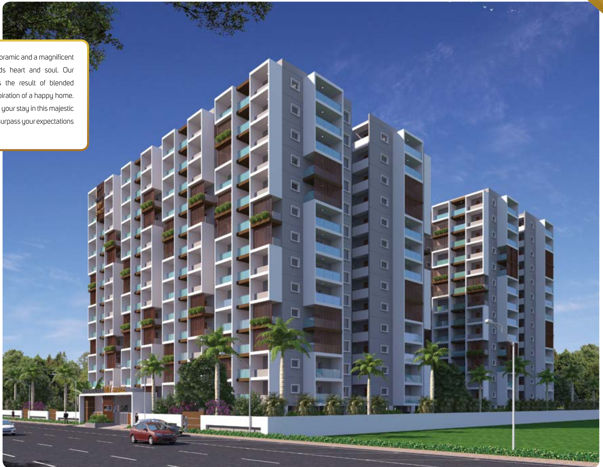
South East View

MySpace is panoramic and a magnificent estate that binds heart and soul. Our workmanship is the result of blended passion and inspiration of a happy home. We promise that your stay in this majestic dwelling would surpass your expectations in every way.