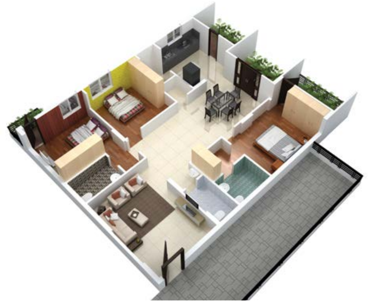
2150 Sft West Facing