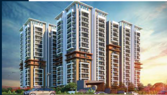
Osman Nagar Luxurious Apartment Project