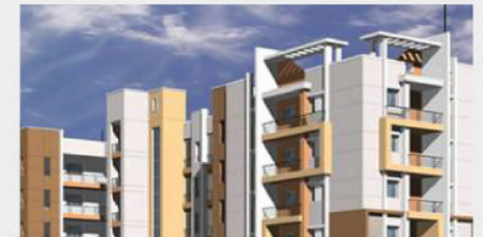
Sudharshan Nagar, Kondapur, Hyderabad Luxurious Apartment Project