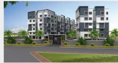
East Maredpally, Hyderabad Luxury Apartments