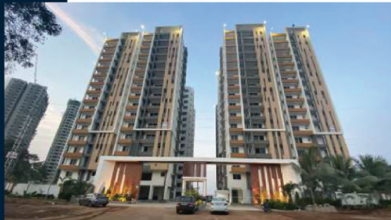
Gopanapally Luxurious Apartment Project