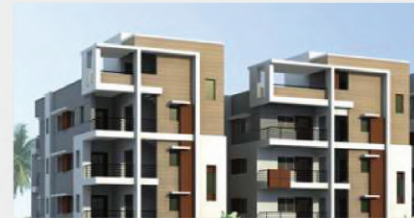
Telecom Nagar, Gachibowli, Hyderabad Luxurious Apartment Project