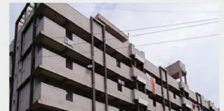
Nandyal Deluxe Apartment Project