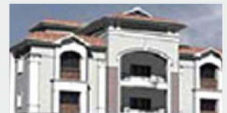
Madhapur, HITECH City, Hyderabad Luxury Apartments