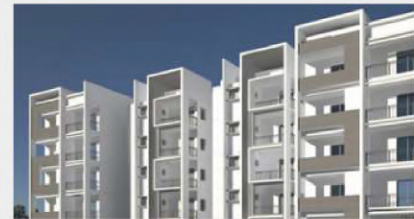
Bapu Nagar, Attapur, Hyderabad Luxurious Apartment Project