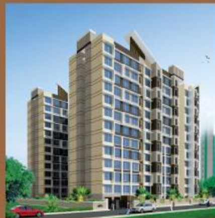
GUNDECHA ASTA Sakinaka Andheri (E)