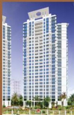
ZENITH B P. K. Road, Mulund (W)