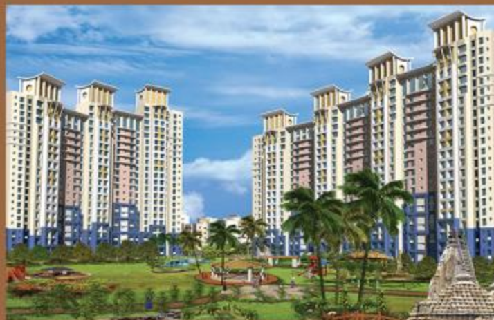
GUNDECHA GARDEN Lalbaug