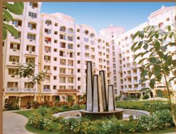
VALLEY OF FLOWERS Kandivall (E)