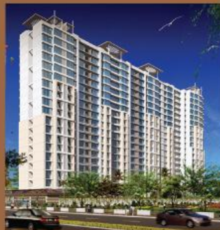
GUNDECHA ALTURA LBS Road, Kanjurmag (W)