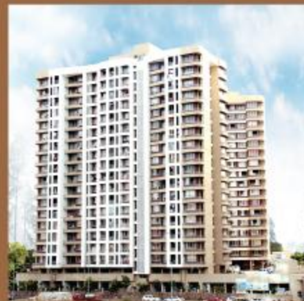
GUNDECHA SYMPHONY Off. Link Road, Andheri (W)