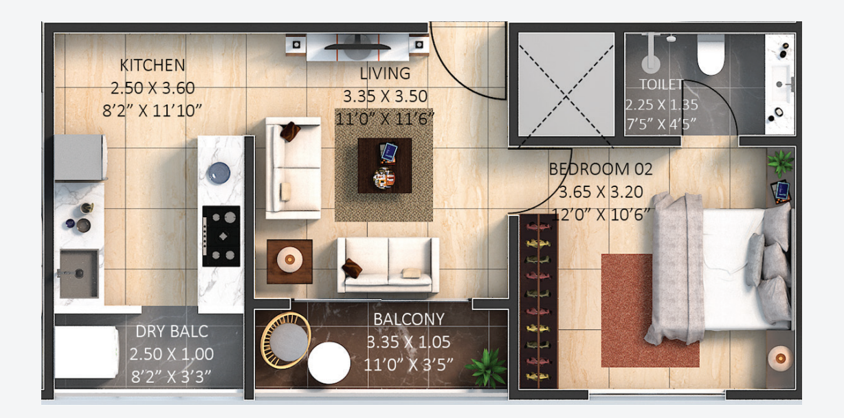
1 BHK : TOTAL CARPET - 463 SQ. FT,