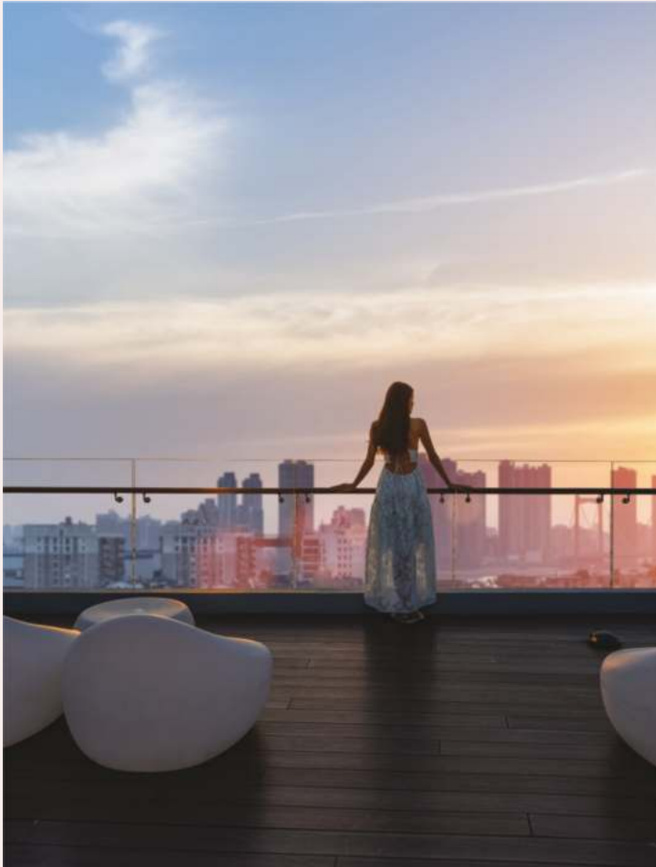
Sunset View Deck