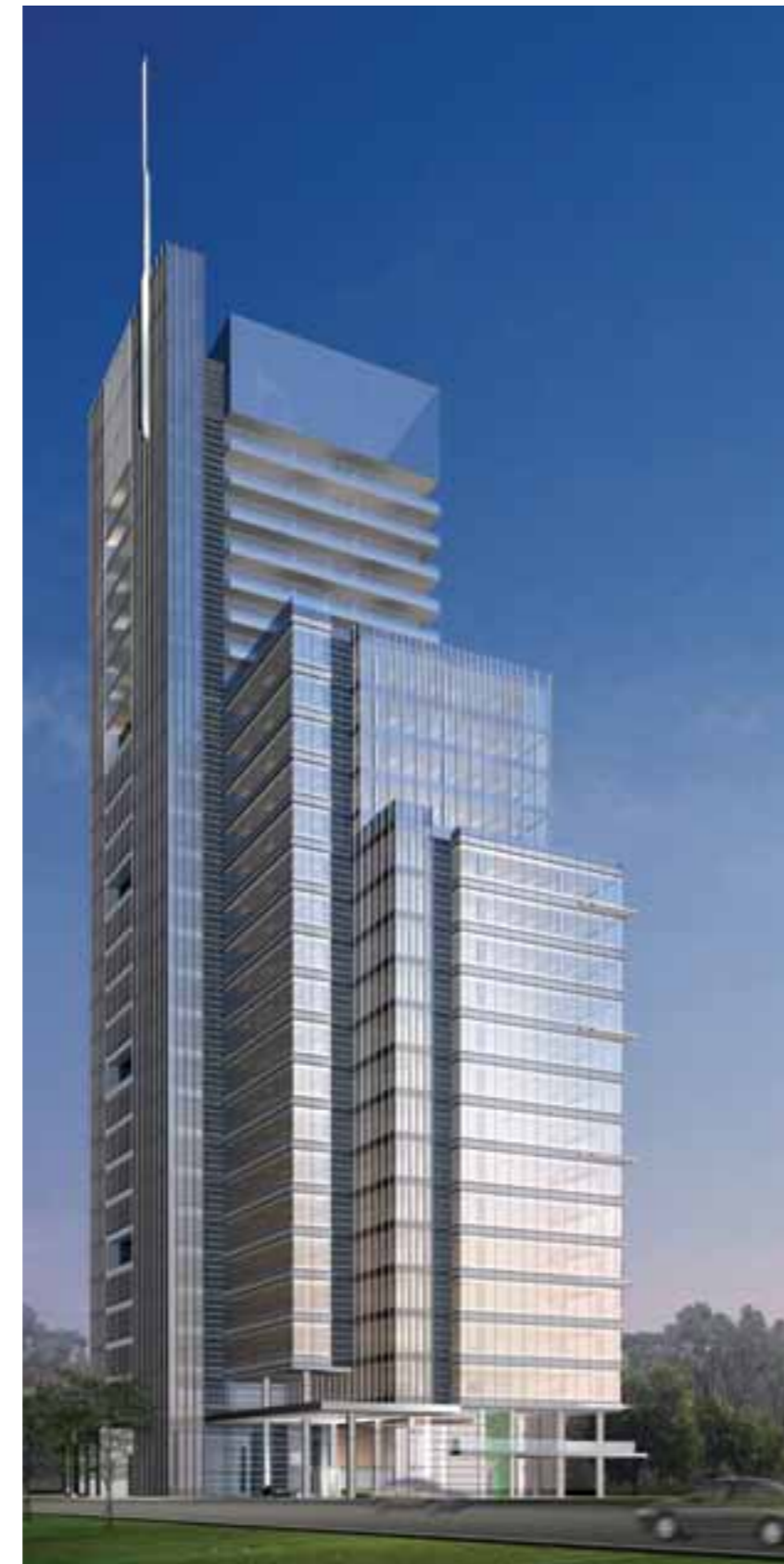
ONE NITESH PLAZA

N itesh Estates, is an integrated real estate developer with a strong presence across four asset classes – Homes, Hotels, Office Buildings and Shopping Malls.