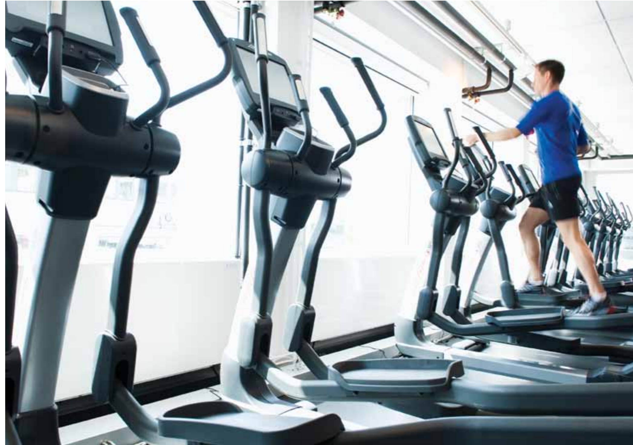
STATE OF THE ART GYMNASIUM