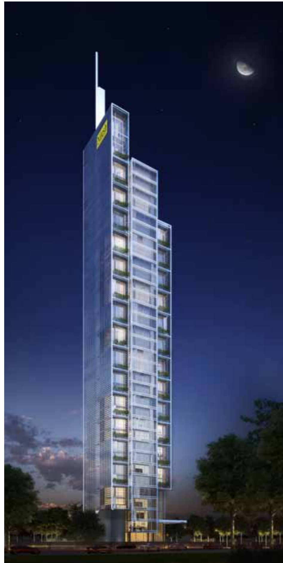
NITESH PARK AVENUE