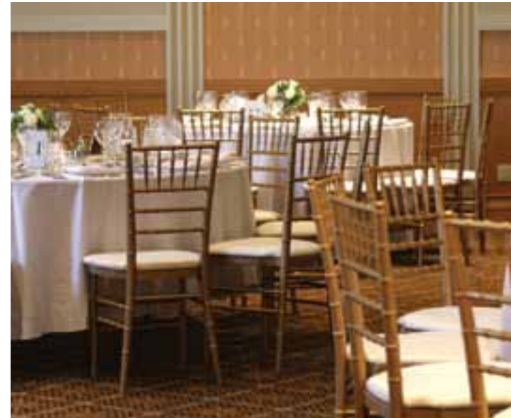
BANQUET / MULTIPURPOSE HALL