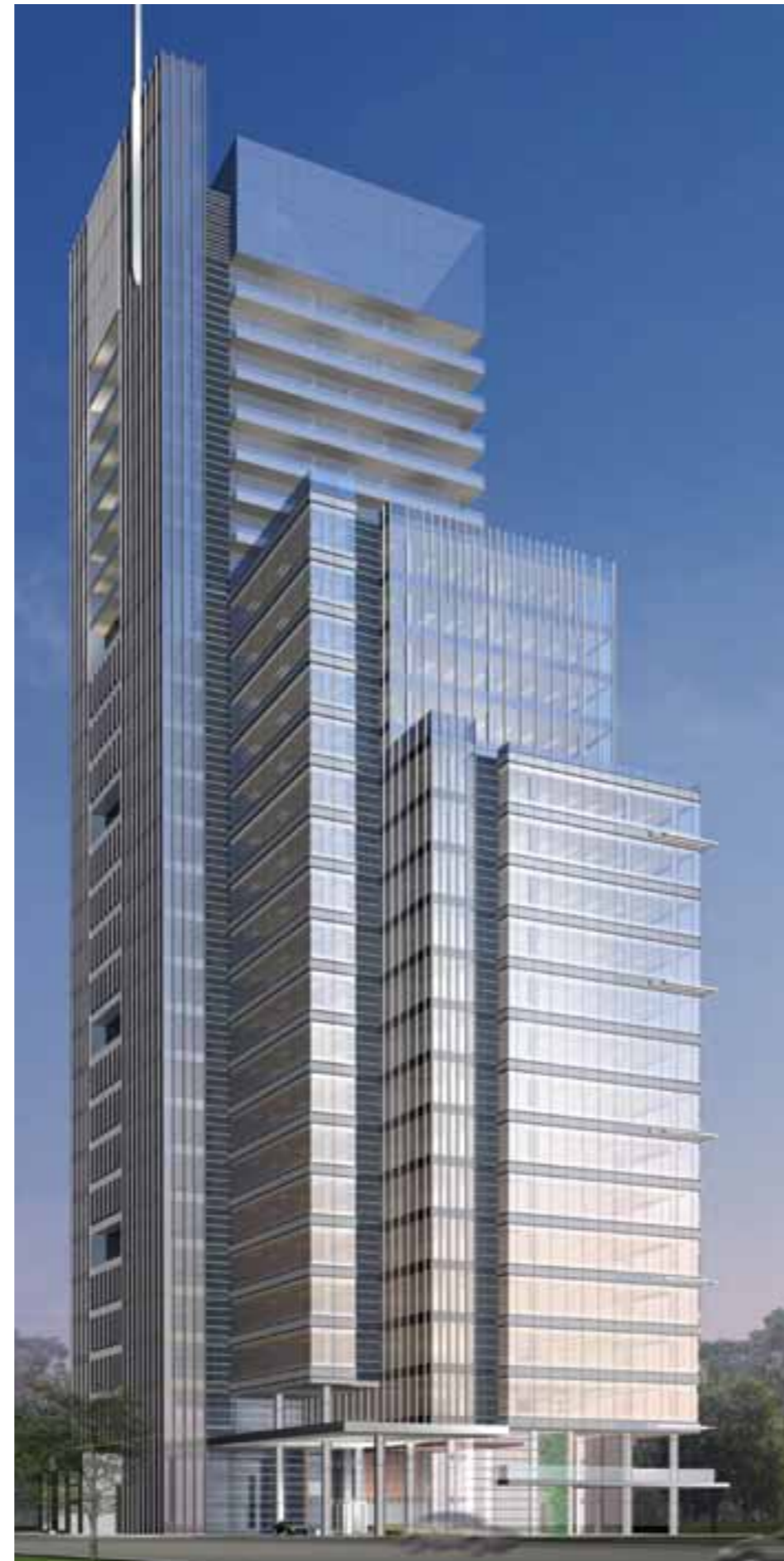
ONE NITESH PLAZA

Nitesh Estates, is an integrated real estate developer with a strong presence across four asset classes – Homes, Hotels, Office Buildings and Shopping Malls.