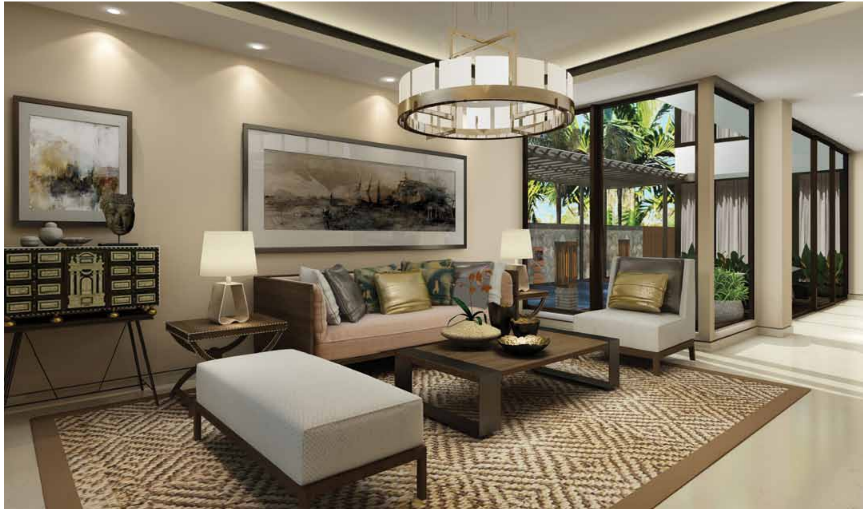
ELEGANT LIVING SPACES