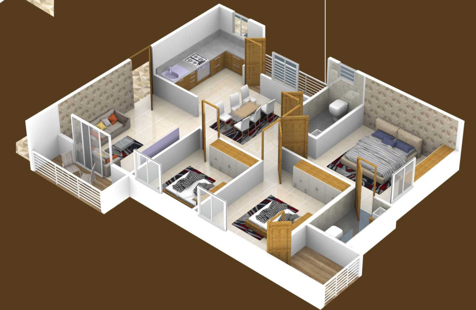
012 1365 SFT 3 BHK EAST