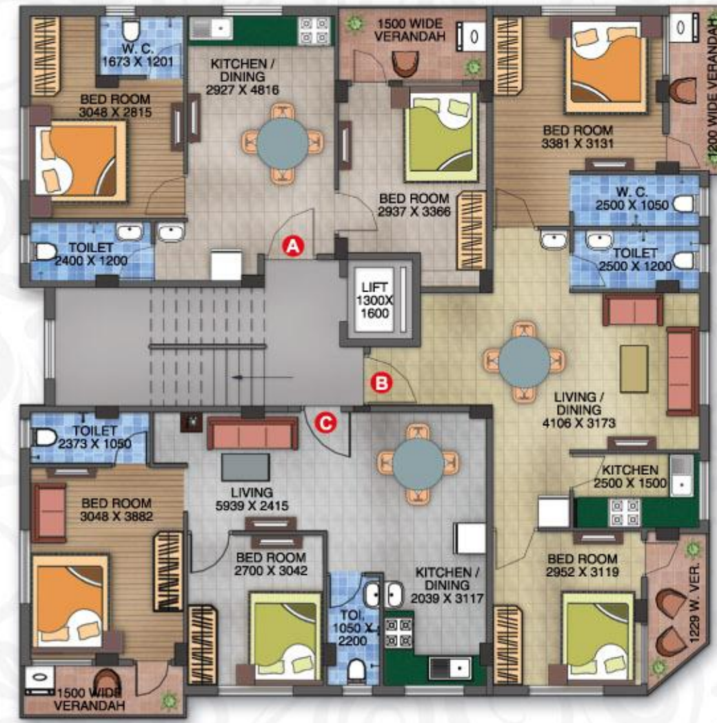
Sukheralay (Typical Floor Plan)