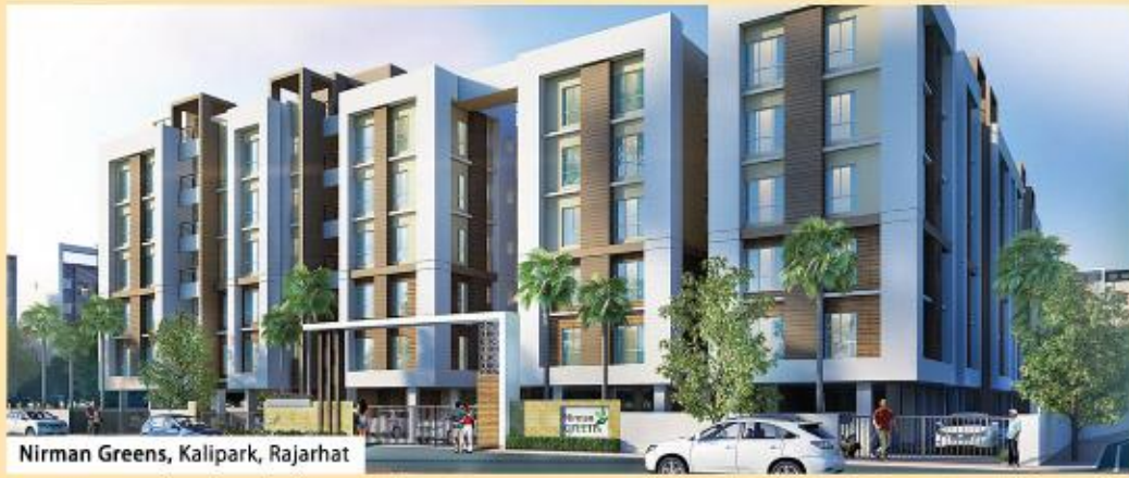
Nirman Greens, Kalipark, Rajarhat