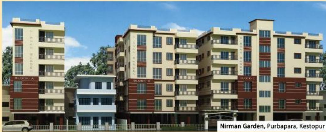
Nirman Garden, Purbapara, Kestopur