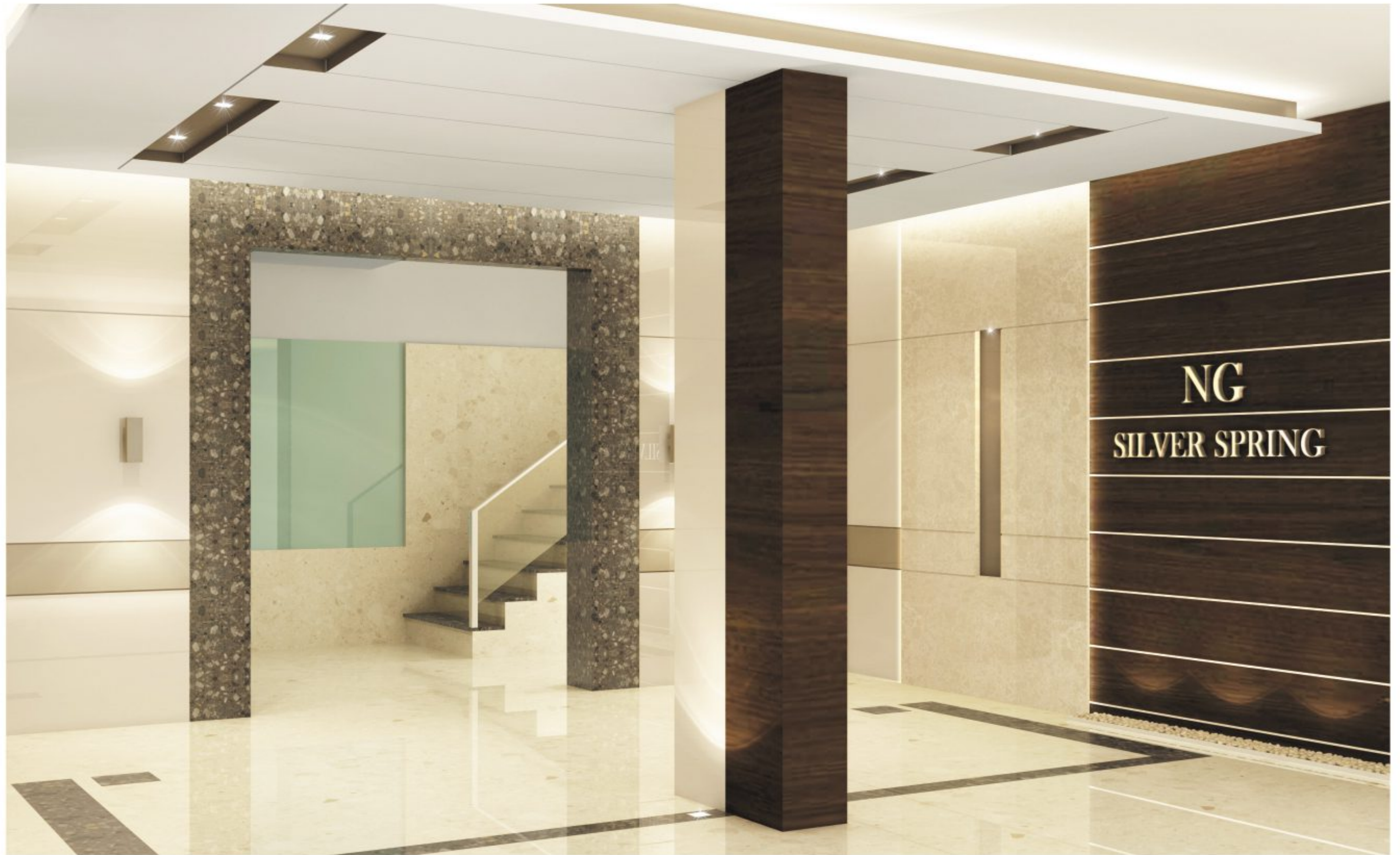
Welcome your visitors at the grand entrance lobby which gives the right gist of the grandeur that NG Silver Spring holds inside.