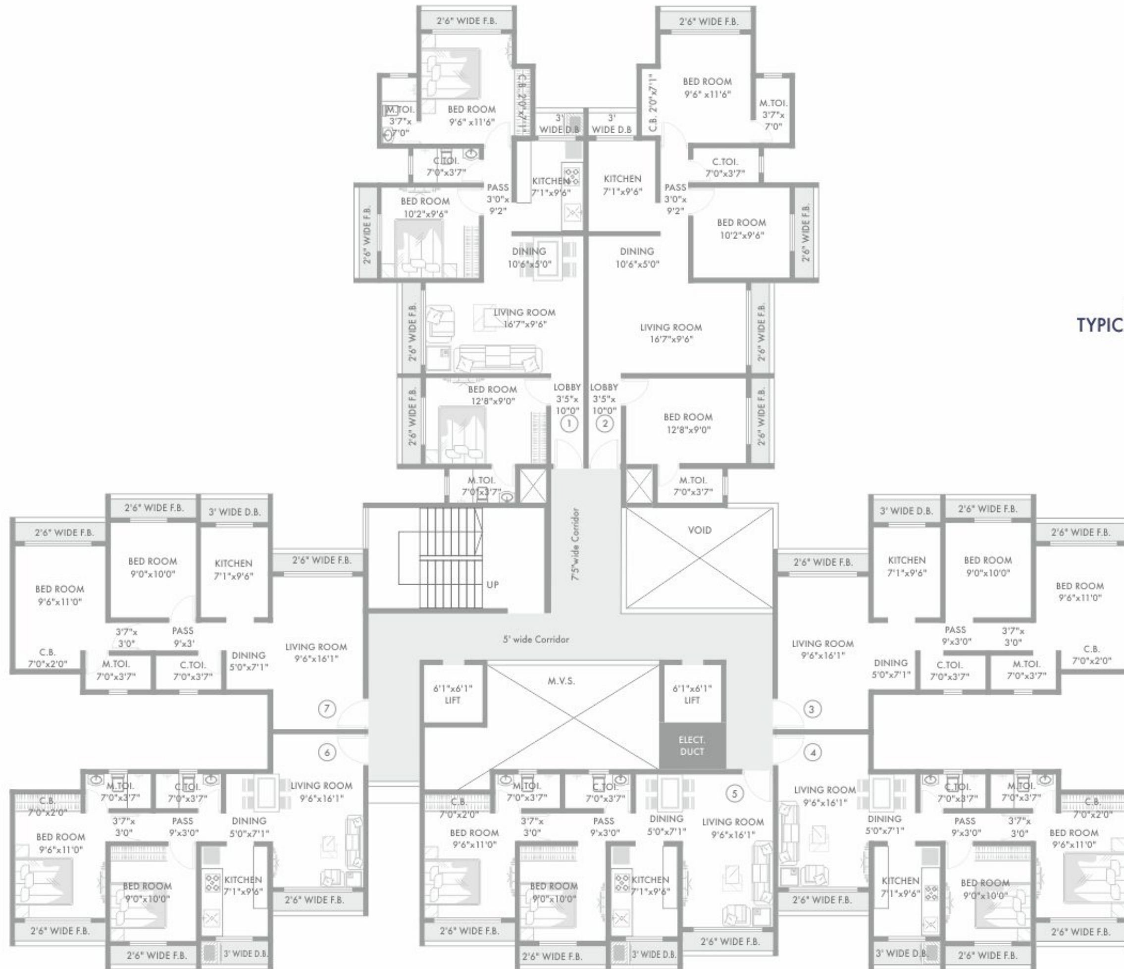
A WING BUILDING NO. - 2 TYPICAL FLOOR PLAN