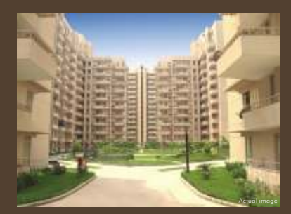
THE LEGEND, GURUGRAM Premium Residential Group Housing