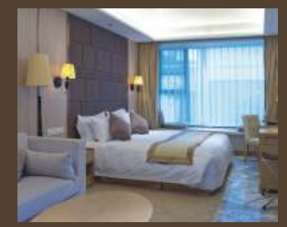
NORA, GURUGRAM One Room Apartments at The Hermitage