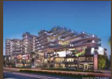
ELEMENT ONE, GURUGRAM High Street Retail and Fully Furnished Serviced Apartments