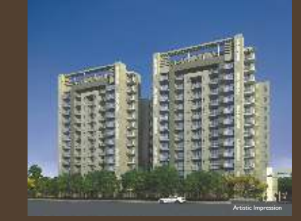
PLATINA. GURUGRAM Luxury Group Housing Project