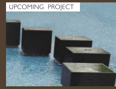
SECTOR-99A, GURUGRAM (3/4 BHK Luxury Residences)