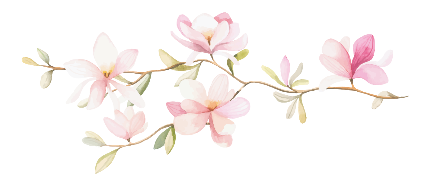
And there's life appreciated.