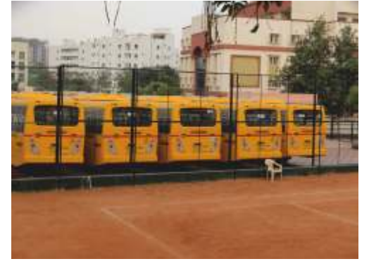
Oakridge International School