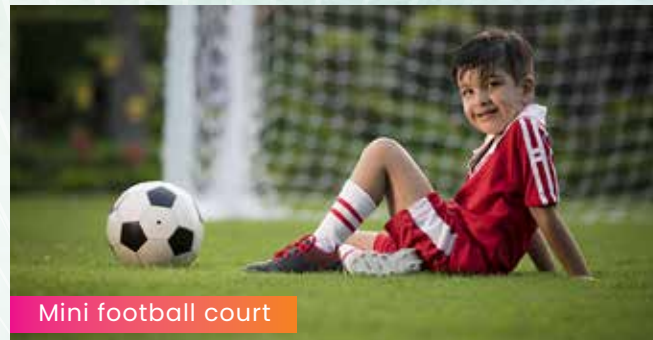
Mini football court