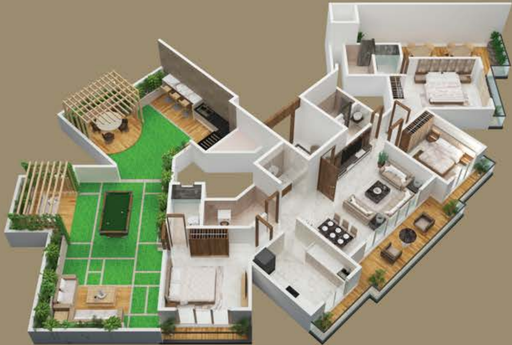
3BHK FLOOR PLAN WITH TERRACE