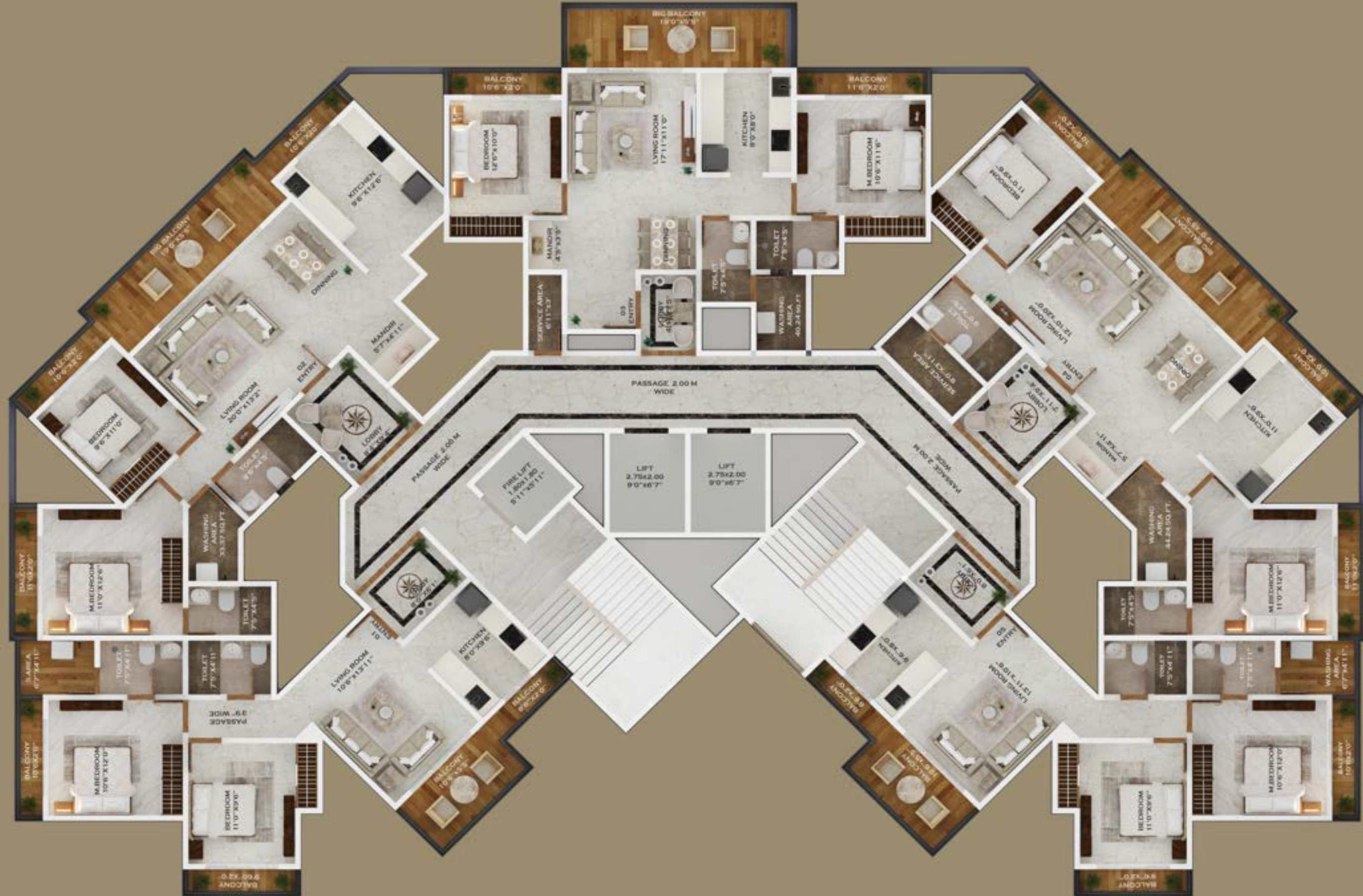
TYPICAL 2BHK FLOOR PLAN