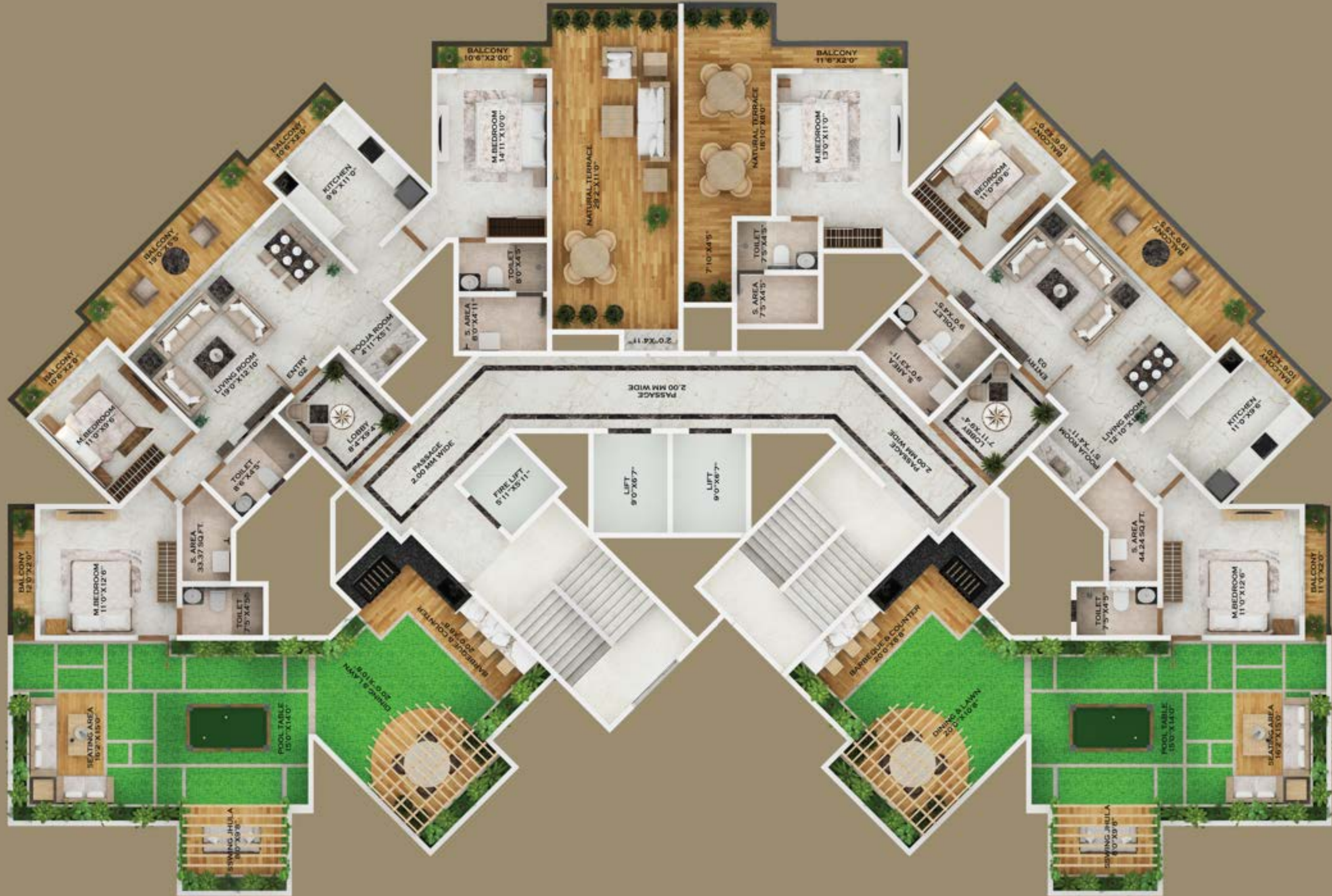
TYPICAL 3BHK WITH TERRACE