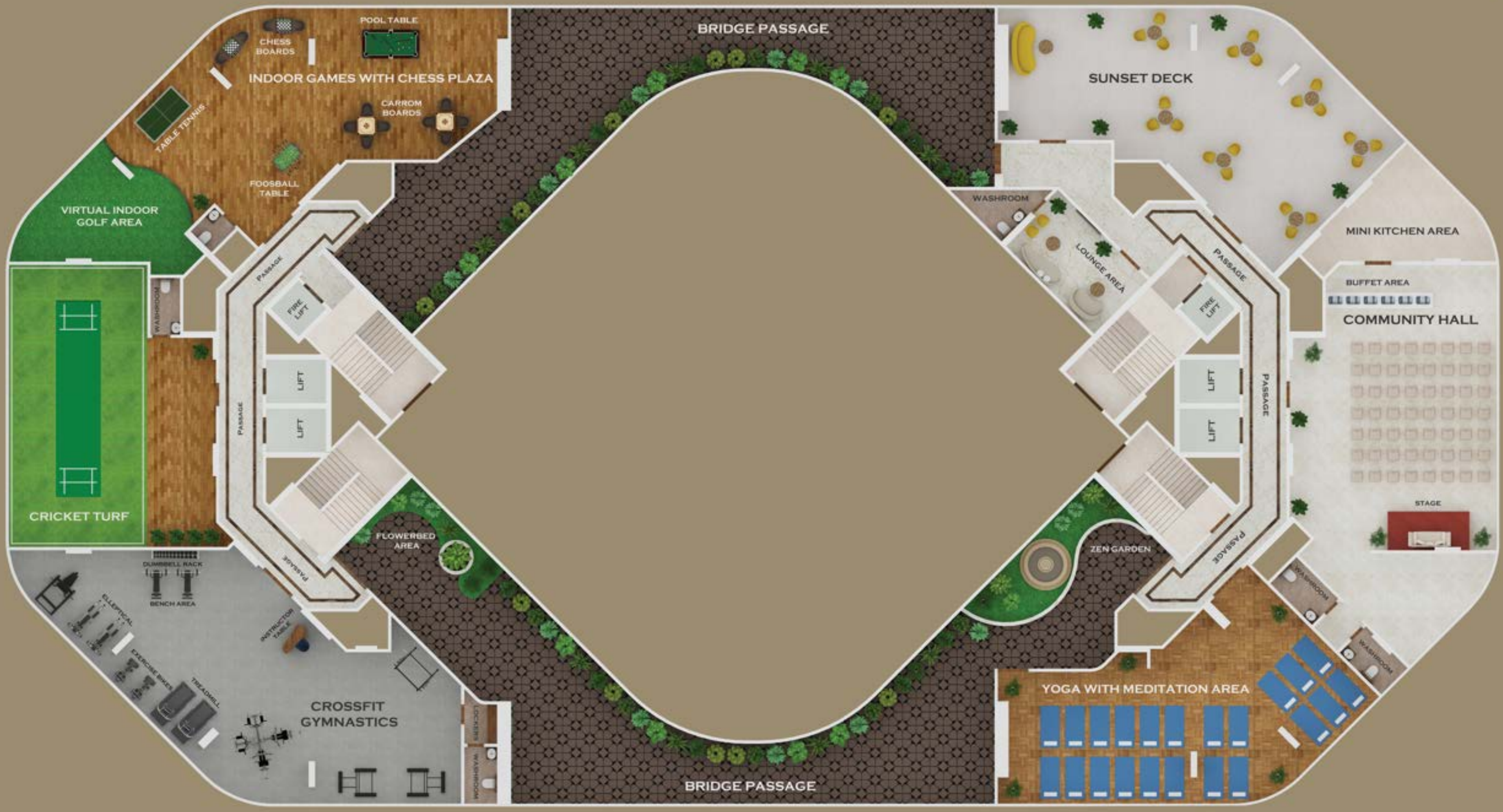
RECREATIONAL PLAN ON 23 RD FLOOR