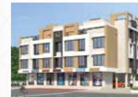
FIA ORCHID Palghar (W)