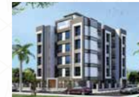
FIA PARADISE Palghar (W)