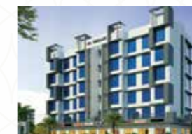
FIA ENCLAVE Palghar (W)