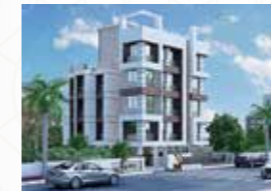
FIA SAPPHIRE Palghar (W)