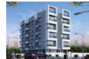
FIA EKDANTA Palghar (W)