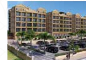
FIA IMPERIA Palghar (W)