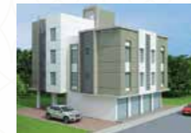
FIA PRANGAN Palghar (W)