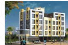
FIA PRIDE Palghar (W)