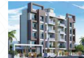
FIA REGENCY Palghar (W)