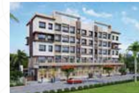
FIA TULIP Palghar (W)