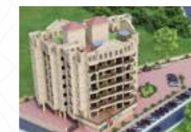
FIA FLORENZA Palghar (W)