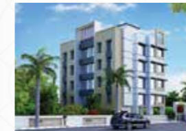
FIA EMERALD Palghar (W)