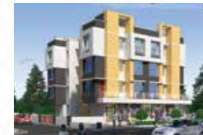
FIA DAFFODILS Palghar (W)