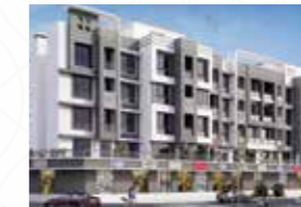
FIA ORION Palghar (E)