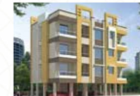
FIA PRATHAM Palghar (W)