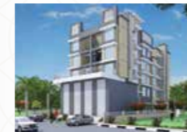
FIA MERIDIEN Palghar (W)