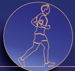
SCENIC ROOFTOP WALK TRAIL

"Legend Is Back" proudly features an RCC Frame Structure with mechanized parking, ensuring its longevity matches that of the residential tower, offering maintenance-free parking for years to come. The grand entrance lobby, elegantly designed, sets the tone for your extraordinary living experience. What's more, our planning ensures perfect ventilation and maximizes space utilization, offering added convenience and comfort. With thoughtfully designed homes, we offer various configurations to match your budget and preferences, considering every detail to make your living experience truly exceptional.