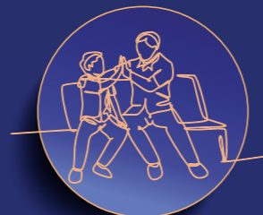
SENIOR CITIZEN SIT-OUT AREA