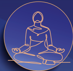
YOGA AND MEDITATION CENTER