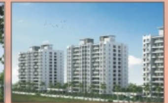
EKDANT Rawal Valley Gwalior

Disclaimer Visual representation shown in this brochure are purely conceptual. All building plans, specifications, floor plans and elevations are tentative and subject to variation and modification by the company of the competent authorised sanctioning plans.