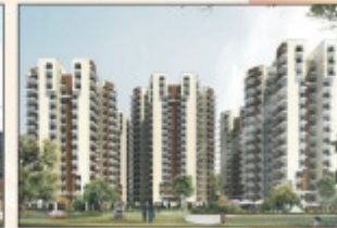
EKDANT FNG Greater Noida