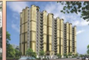
EKDANT Dronagiri Vasundhara