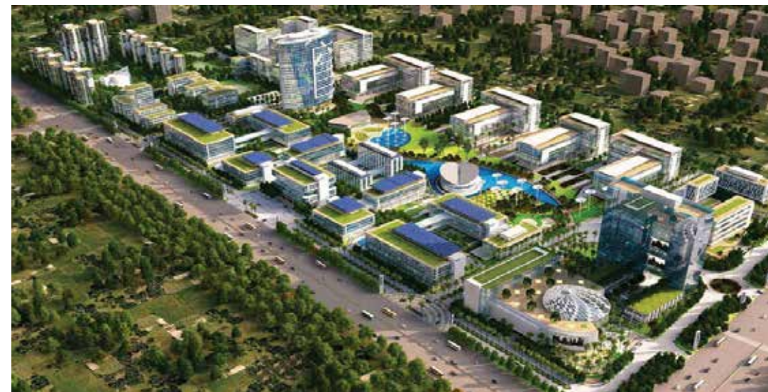
HCL IT City, Lucknow

From the airport, drive down Amar Shaheed Path and proceed on the road to Sultanpur. In under two minutes, you'll pass by the IT City and Cancer Institute. Opposite the Amul Dairy Plant and The IT City is Pintail City, a 200-acre integrated development.