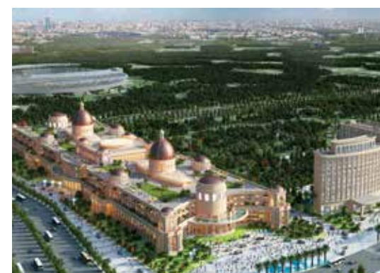
Shaan-e-Awadh Shopping Mall