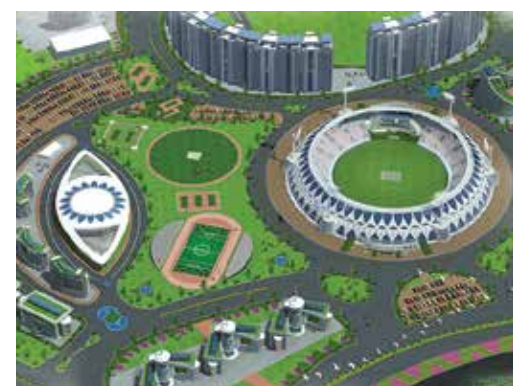
International Cricket Stadium