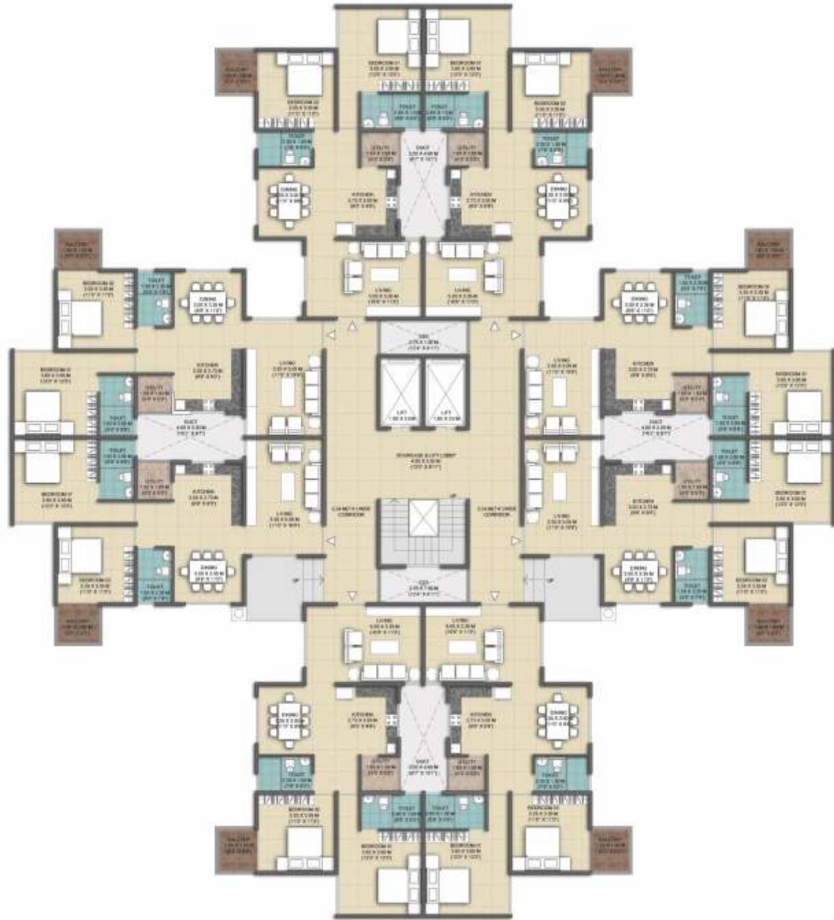
STANDARD FLOOR PLAN 2 BHK