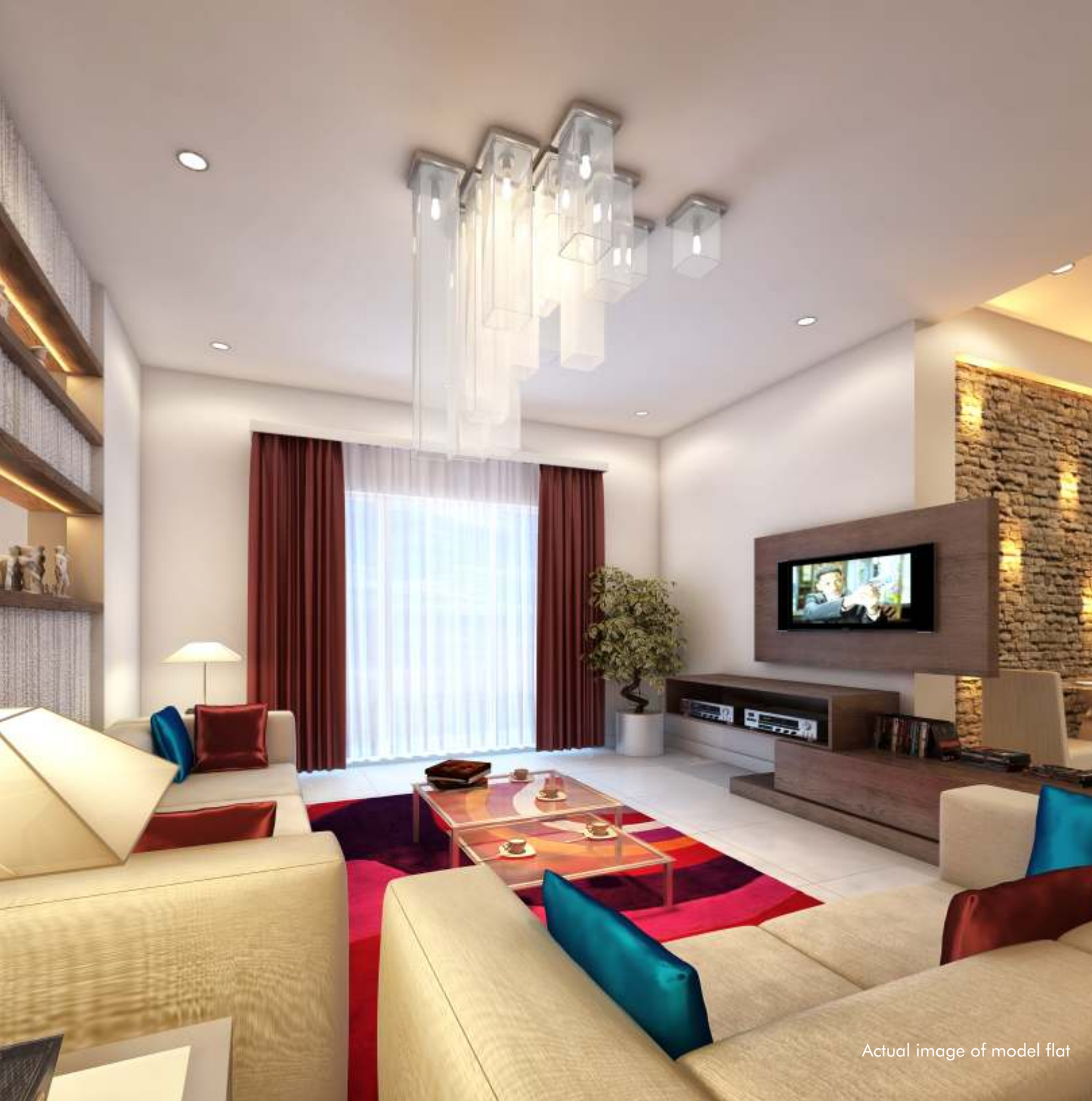
Actual image of model flat