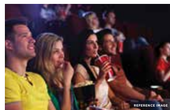
ENTERTAINMENT & MULTIPLEX ZONE