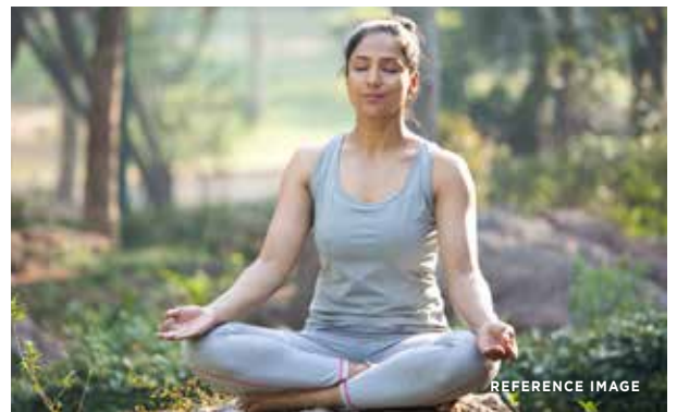
YOGA AND MEDITATION AREA