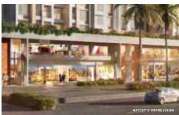
HIGH STREET & MALL