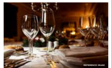
FINE DINING RESTAURANTS