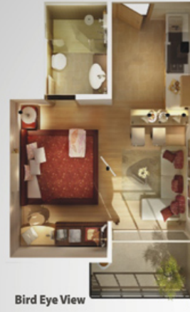
Bird Eye View