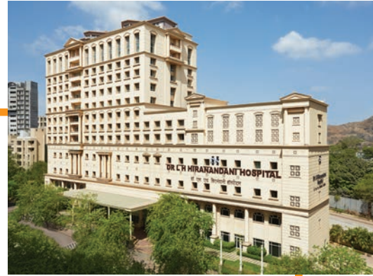
Dr L H Hiranandani Hospital