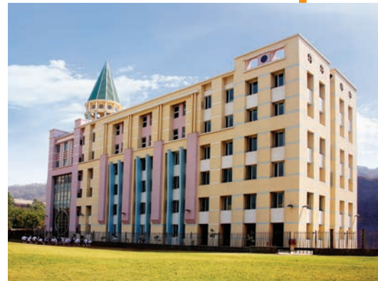
HFS International School