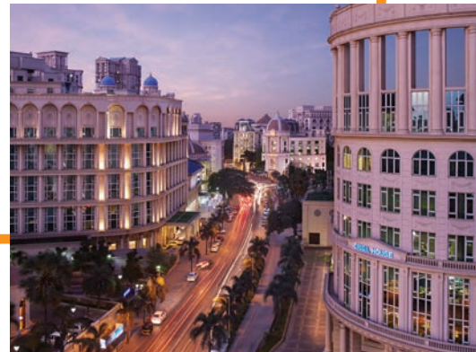
Hiranandani Business Park