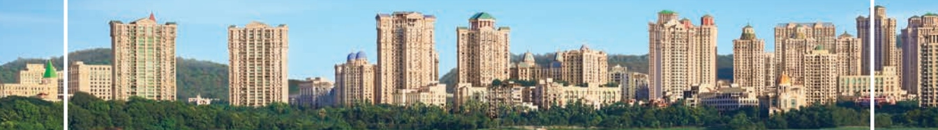
Actual image of Hiranandani Gardens, Powai.

Back in 1983, Powai was a quarry land with just 20 trees, which was transformed into the country's first self-contained 250 acres township – Hiranandani Gardens, Powai . It's a vibrant integrated township which epitomizes community living giving a holistic experience. The social fabric comprises of best in class educational, healthcare, retail, hospitality and entertainment amenities inclusive of eco-green spaces enriching residents' quality of life. The township also encompasses the serene nature trail, water bodies and unparalleled civic infrastructure to upkeep the standard of living and offer exclusive lifestyle.