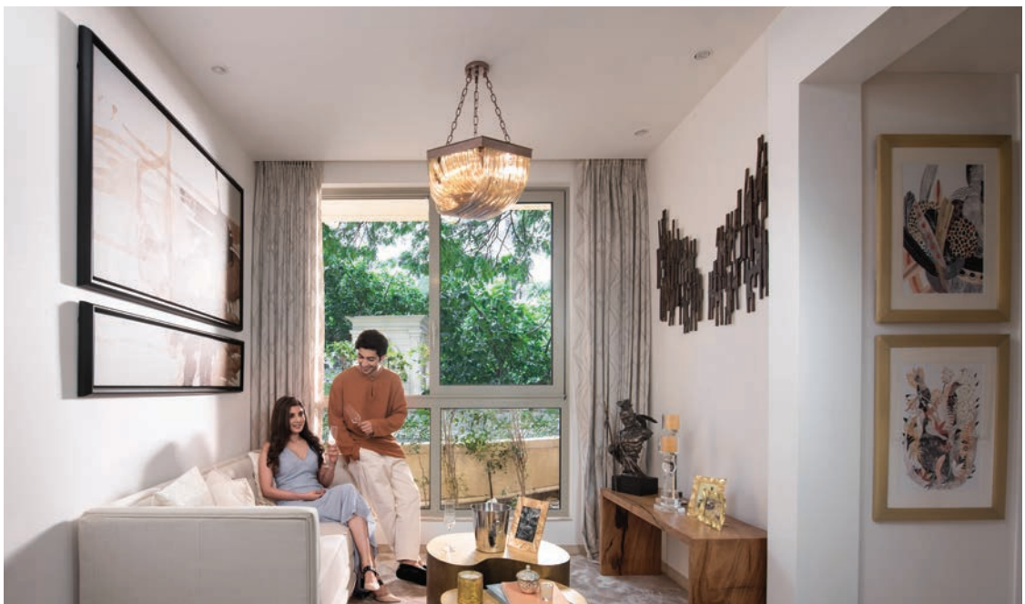
The above image shown is of show apartment of 1 BHK at Sales Gallery for reference purpose only. The furniture & fixtures shown in the above flat are not part of the apartment amenities.