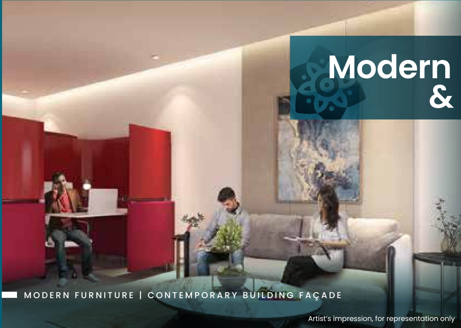
MODERN FURNITURE | CONTEMPORARY BUILDING FAÇADE

Artist's impression, for representation only