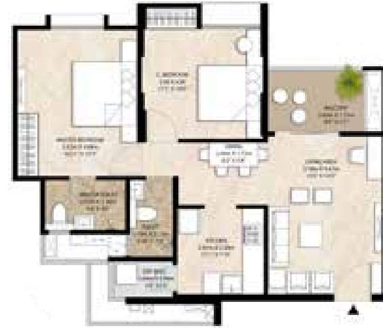
2 BHK C