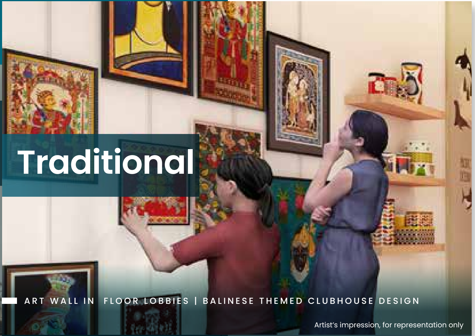
ART WALL IN FLOOR LOBBIES | BALINESE THEMED CLUBHOUSE DESIGN

Artist's impression, for representation only