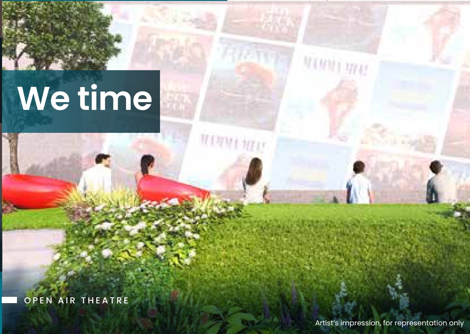
OPEN AIR THEATRE

Artist's impression, for representation only