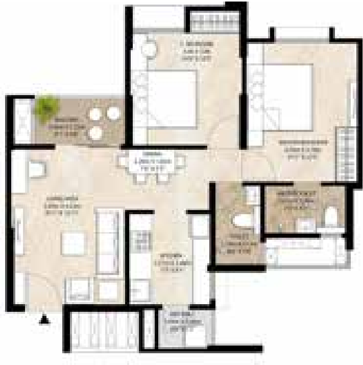
2 BHK A